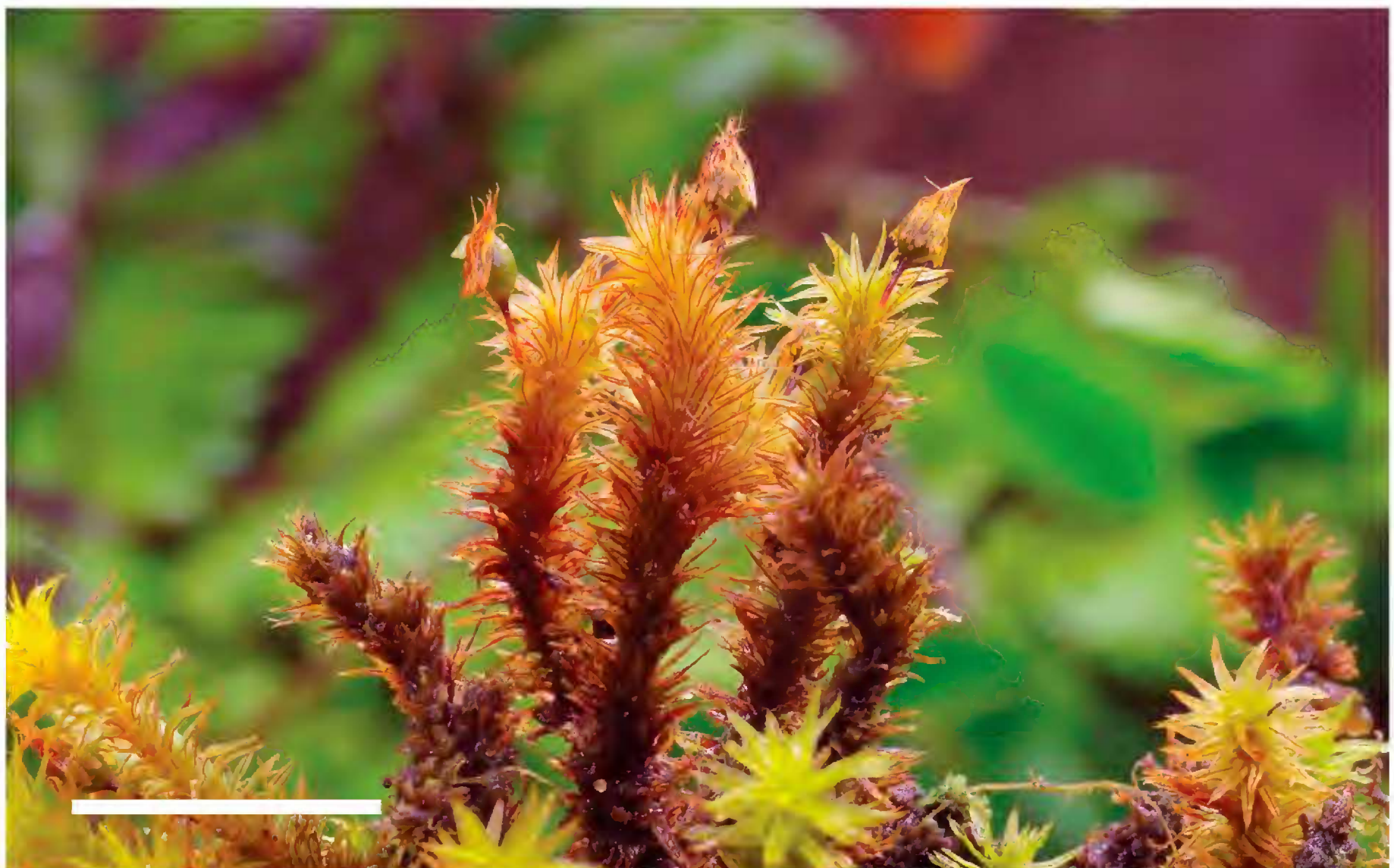
Fig. 1. Macromitrium erythrocomum sp. nov. (Meagher WT-1022 & Cairns). Scale bar: 10 mm.

Perigonia not seen. Perichaetium on a very short lateral branch. Perichaetial leaves triangular-lanceolate, shorter than branch leaves, inner leaves 3.0\text{--}3.17 \times 0.75 mm; costa excurrent, filling an acumen 0.4 mm long. Vaginulae with a few hairs. Seta short, 3.5\text{--}4.0 ( -6.0 ) mm stout, smooth, erect, not twisted. Capsule ovoid-globose when young, narrower when mature, 2.4\text{--}3.2 mm long including operculum, 1.0\text{--}1.1 mm wide; urn with narrow 4–6 plicate mouth, strongly puckered when dry; operculum conic with upright rostrum 1.0\text{--}1.1 mm long; peristome lacking or reduced to a basal membrane; exothecial cells rectangular to elongate-rectangular or rhomboidal, smaller and rectangular quadrate near rim, thick-walled, 18\text{--}26 \times 45\text{--}62\ \mu\text{m} . Stomata not seen. Spores anisomorphic, 26\text{--}29\ \mu\text{m} , and 13\text{--}16\ \mu\text{m} , surface lightly papillose. Calyptra mitrate, about 3 mm long, plicate, covering but not enclosing the capsule, with erect stiff rusty red hairs 58\text{--}62\ \mu\text{m} thick, arising from base to top of calyptra and denticulate because of protruding cell ends; base lacerate into 8 segments to top of urn, sometimes with one split longer and the calyptra thus appearing cucullate. Figs 1–3.