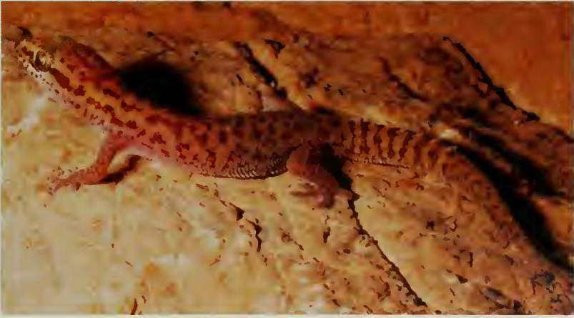
PLATE 1. Holotype of Pachydactylus parascutatus sp. nov. in life.

ing incomplete bands on some tail segments; dorsal surfaces of limbs mottled with scattered brown markings similar to those of dorsum. A thick, brown line from nostril, across canthus rostralis, to orbit, continuing posteriorly to approximately level of occiput, breaking up into markings that merge with dorsal pattern; bordered above by a thick whitish line, most distinct between nostril and anterodorsal corner of orbit. A series of three weakly defined, mid-brown, concentric semicircles extending posteriorly from frontoparietal suture, posterior border of orbit and occiput, respectively. Labial scales whitish; anterior supralabials and all infralabials bearing mid-brown markings. Venter buff with light specklings of brown pigment on all but midventral scales of chest and abdomen, densest on underside of tail and thighs.