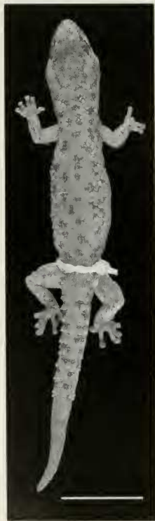
FIGURE 3. Holotype of P. parascutatus , sp. nov. (SMWR 9454) from Para Camp, 2 km north of Sesfontein, Opuwo District, Namibia. Scale bar = 10 mm.

Coloration (in life; Pl. 1). Ground color of dorsum beige to yellowish brown with relatively regularly arranged mid-brown, roughly diamond-shaped markings; flanks with a pale rosy flush from underlying tissue; original tail with a series of darker markings at each pair of smaller dorsal scale rows, form-