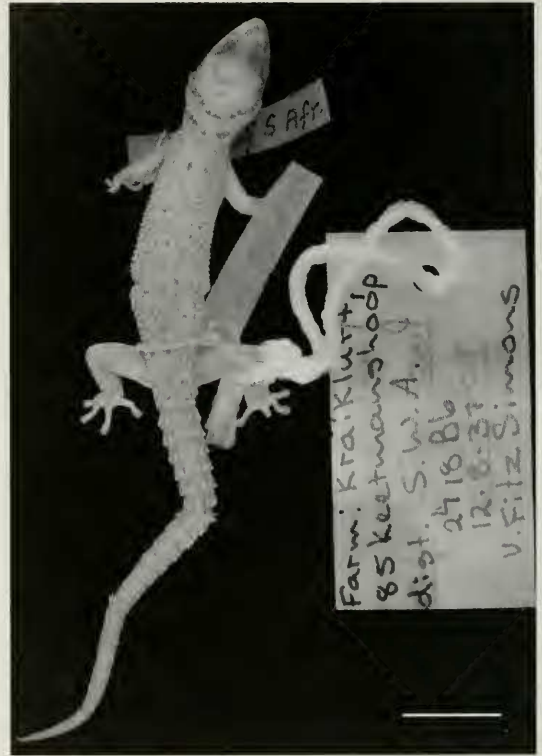
FIGURE 1. Holotype of Pachydactylus robertsi (TM 17854). Note the position and width of the nuchal collar. Scale bar = 10 mm.

HOLOTYPE. — National Museum of Namibia (SMW) R 9454 (previously California Academy of Sciences [CAS] 214755; Field Number AMB 6518) (adult female), from the vicinity of Para Camp,