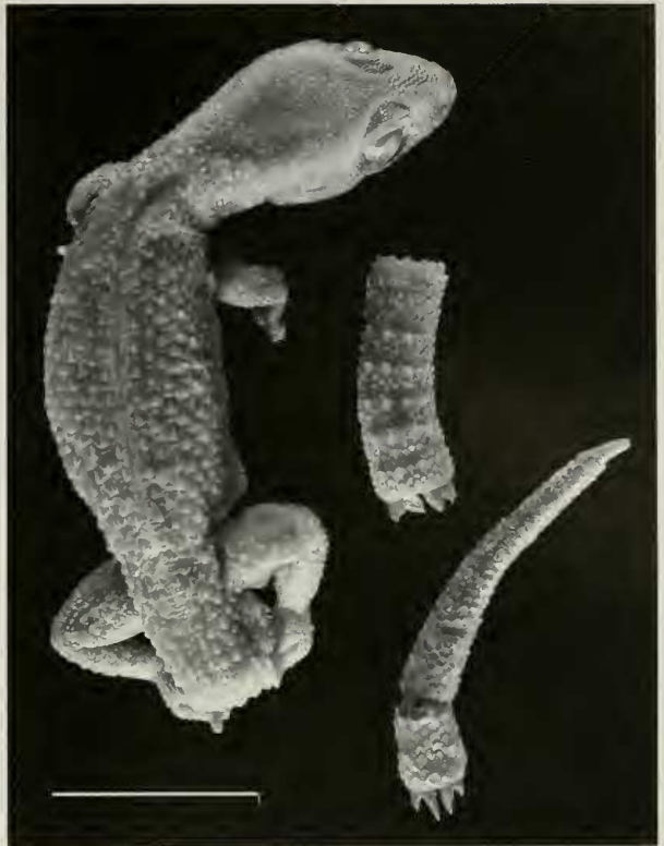
FIGURE 2. Holotype of Pachydactylus angolensis (AMNH R 47874). Scale bar = 10 mm.

DESCRIPTION (based on holotype). — Adult female (Fig. 3, Pl. 1). Snout-vent length 35.25 mm. Body sub-cylindrical, not markedly depressed, elongate (A-G/SVL ratio 0.44). Head elongate, large (HL/SVL ratio 0.29), moderately wide (HW/SVL ratio 0.19), somewhat depressed (HD/HL ratio 0.36), distinct from neck. Lores and interorbital region inflated. Snout short (E-S/HW ratio 0.57), longer than eye diameter (ED/E-S ratio 0.63); scales on snout and forehead flattened, round to oval; scales on snout much larger than those of parietal table. Eye relatively small (ED/HL ratio 0.23); orbits without extra-brillar fringes; posterior supraciliary scales bearing small spines; pupil vertical, with crenelated margins. Ear opening oval, small (EL/HL ratio 0.07), greatest diameter horizontal; eye to ear distance greater than diameter of eyes (E-E/ED ratio 1.09). An irregular series of flattened to