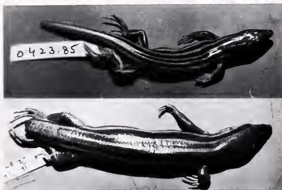
Figure 2A (top) and B (bottom). Eumeces indothalensis new species.