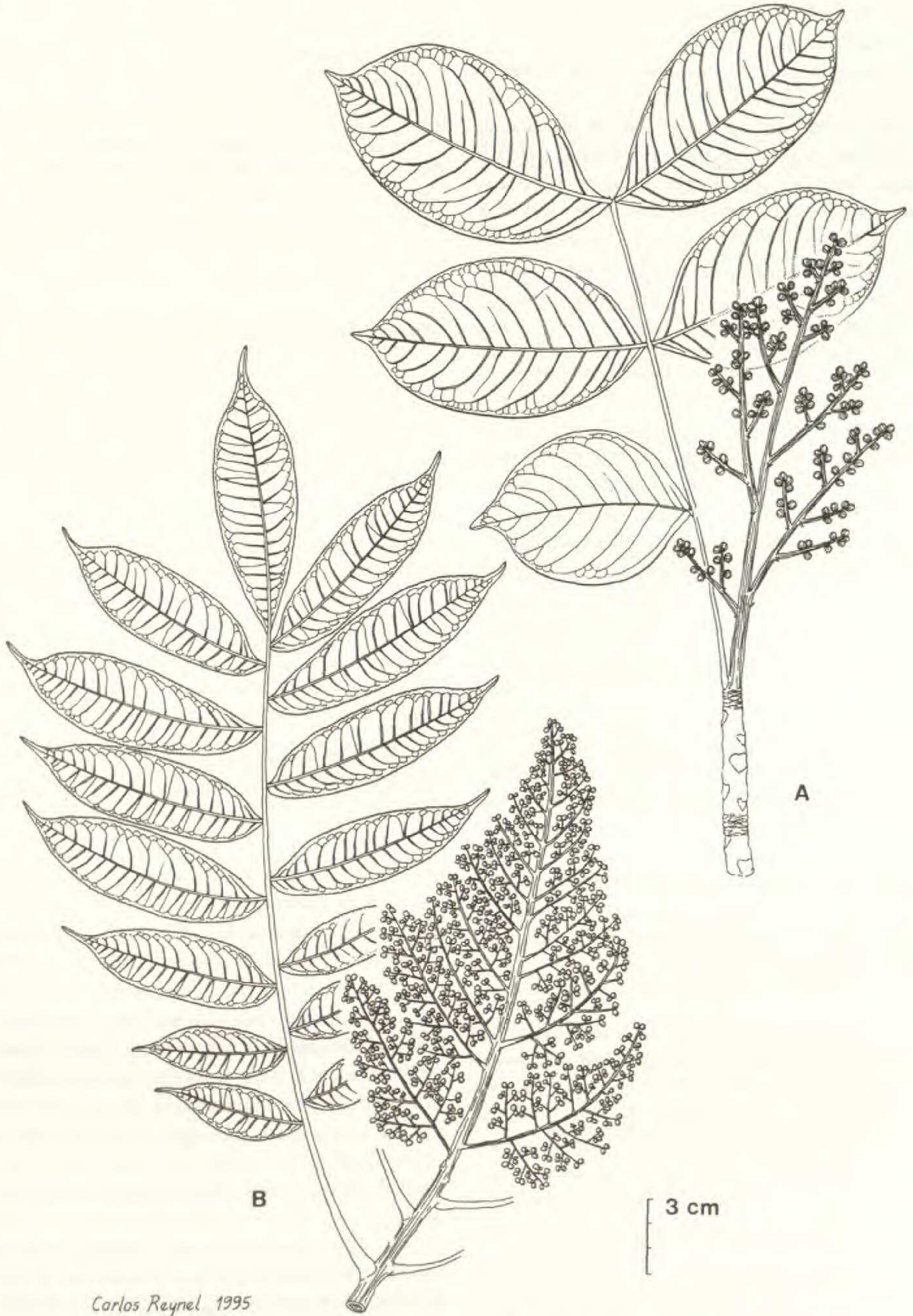
Figure 1. —A. Zanthoxylum gentryi Reynel, apical branchlet with leaf and inflorescence (Ramos 2334). —B. Zanthoxylum lenticulare Reynel, apical branchlet with leaf and infructescence (Soejarto et al. 4058).

1.4 mm, the apex rounded to acute, strongly inflexed, usually with an ellipsoid resin gland to 0.2 mm diam., the petals glabrous. Staminate flowers with 5 stamens, exerted \frac{1}{3} – \frac{1}{2} their total length; filaments slender, 2.8–4 mm long, anthers 1.2–1.8