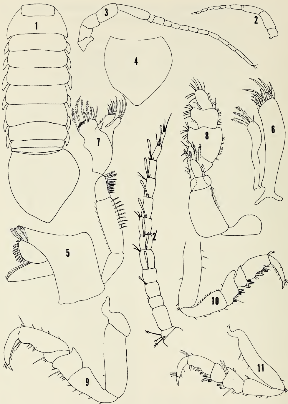
Figs. 1–11. Sphaerolana karenae , ♂ from Montemorelos (except 2'): 1, Habitus, dorsal; 2, Antenna 1; 2', Antenna 1, ♂ from Santiago; 3, Antenna 2; 4, Telson; 5, Right Mandible; 6, Maxilla 1; 7, Maxilla 2; 8, Maxilleped; 9, Pereopod 1; 10, Pereopod 2; 11, Pereopod 3.