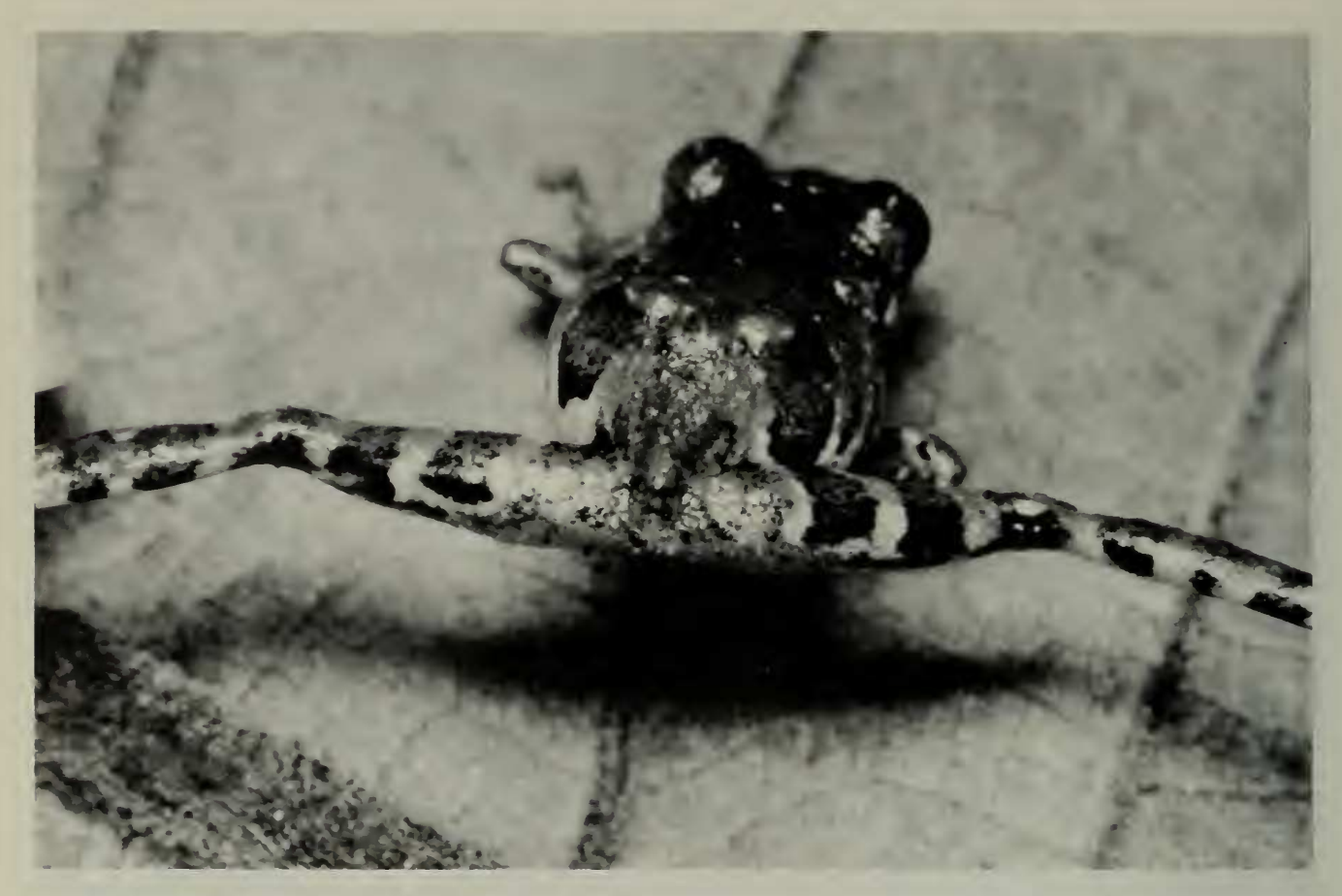
Fig. 2. Pattern of posterior surface of thighs in Eleutherodactylus polymniae, paratype, UTA A-23511.

1970b). Other than sharing distinctive digital pads, few characters have been reported to suggest that this group is monophyletic. Geographically, the group is relatively compact, with 11 species along the Atlantic coastal plain and versant from Tamaulipas, México, southward through much of the Yucatán Peninsula to the mountains of northern Guatemala. One species, E. guerreroensis, is restricted to the Pacific versant. and another, E. stuarti, occurs on both the Atlantic and Pacific side of the Continental Divide (Fig. 4). Most species have extremely restricted montane distributions, and many are known from fewer than half a dozen specimens. Eleutherodactylus alfredi has a wide distribution, ranging from eastcentral Veracruz (Smith & Taylor 1948) to Tabasco (Lee 1980) and Piedras Negras, Guatemala (Duellman 1960, Stuart 1963). Eleutherodactylus decoratus occurs along the Atlantic slopes of the Sierra Madre Oriental from southern Tamaulipas to central Ve-