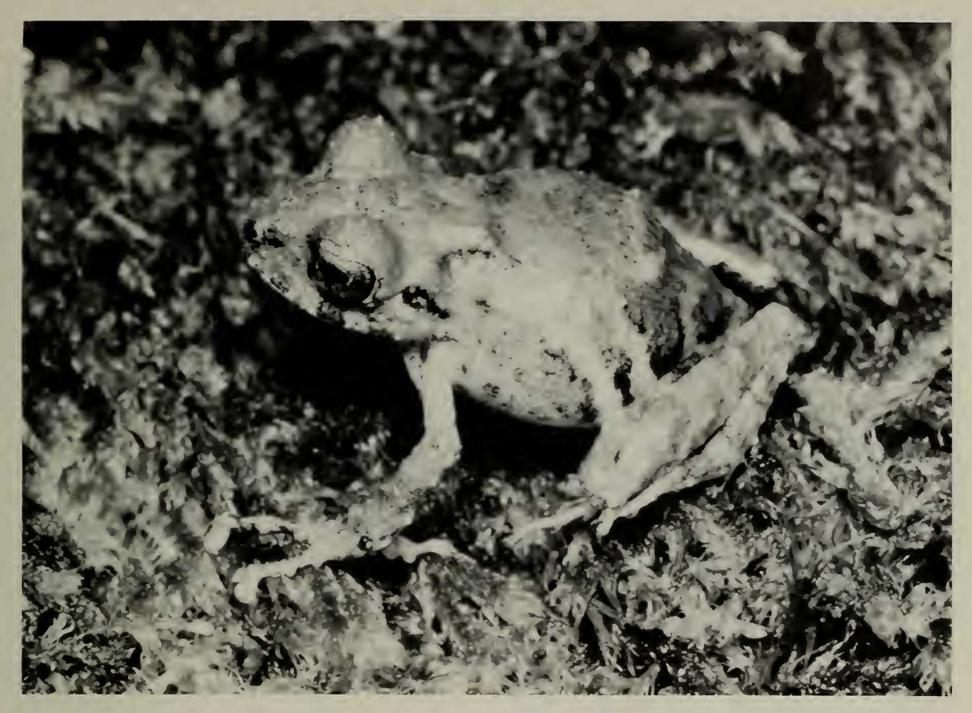
Fig. 1. Eleutherodactylus polymniae, new species, holotype, SVL 19.7 mm, UTA A-12976.

Variation. — The paratype (UTA A-23511) is similar to the holotype in most aspects of morphology, color, and pattern. Measurements for the paratype are as follows: SVL, 19.0 mm; head length, 7.9 mm; head width, 7.3 mm; horizontal distance across eye, 2.5 mm; eye to tip of snout, 3.4 mm; eye to nostril, 2.3 mm; horizontal distance across tympanum, 0.8 mm; tibia, 11.6 mm; and distance from proximal edge of inner metatarsal tubercle to distal tip of fourth toe, 9.5 mm.