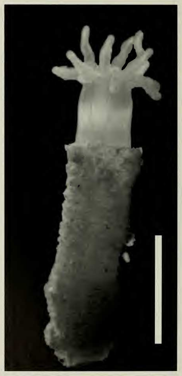
Fig. 1. External anatomy of preserved specimen of Edwardsiella lineata (USNM 53363). Scale bar = 3.0 mm.