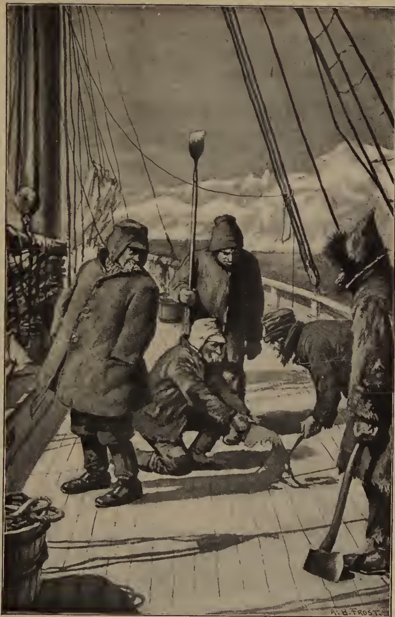
THE MATE'S SHADOW FROZE TO THE DECK