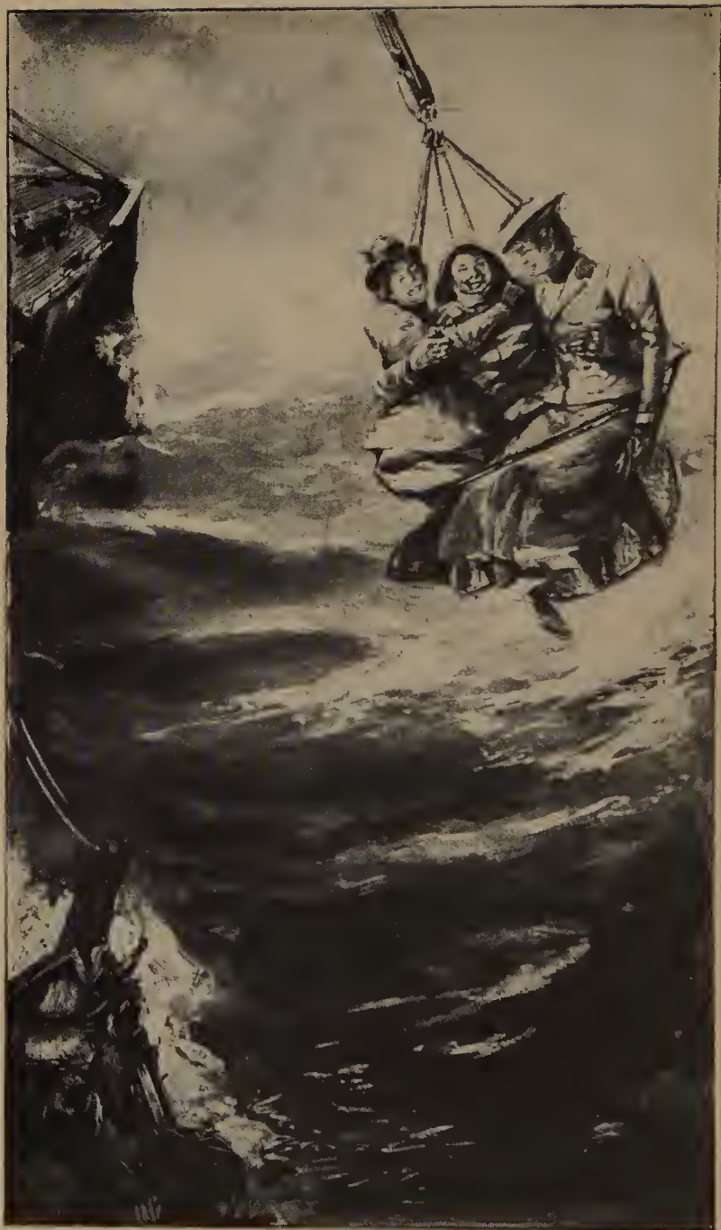
PROTECTING THE LADIES