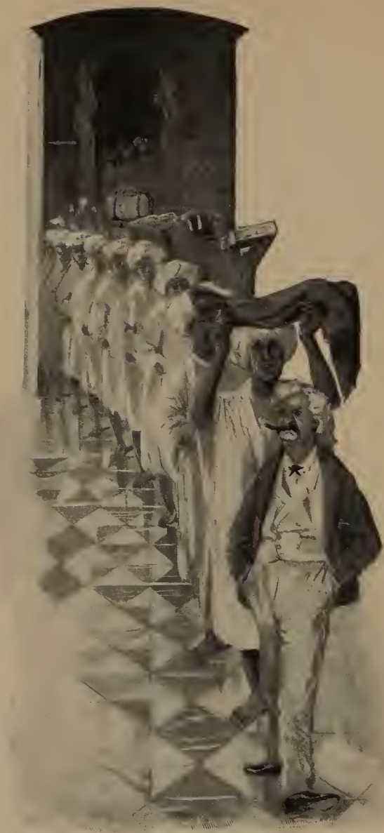
EACH CARRIED ONE ARTICLE