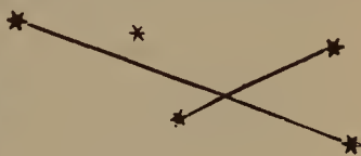
OUT OF REPAIR.

It consists of four large stars and one little one. The little one is out of line and further damages the shape. It should have been placed at the intersection of the stem and the cross-bar.