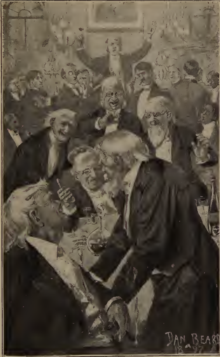
THE OLD SETTLERS