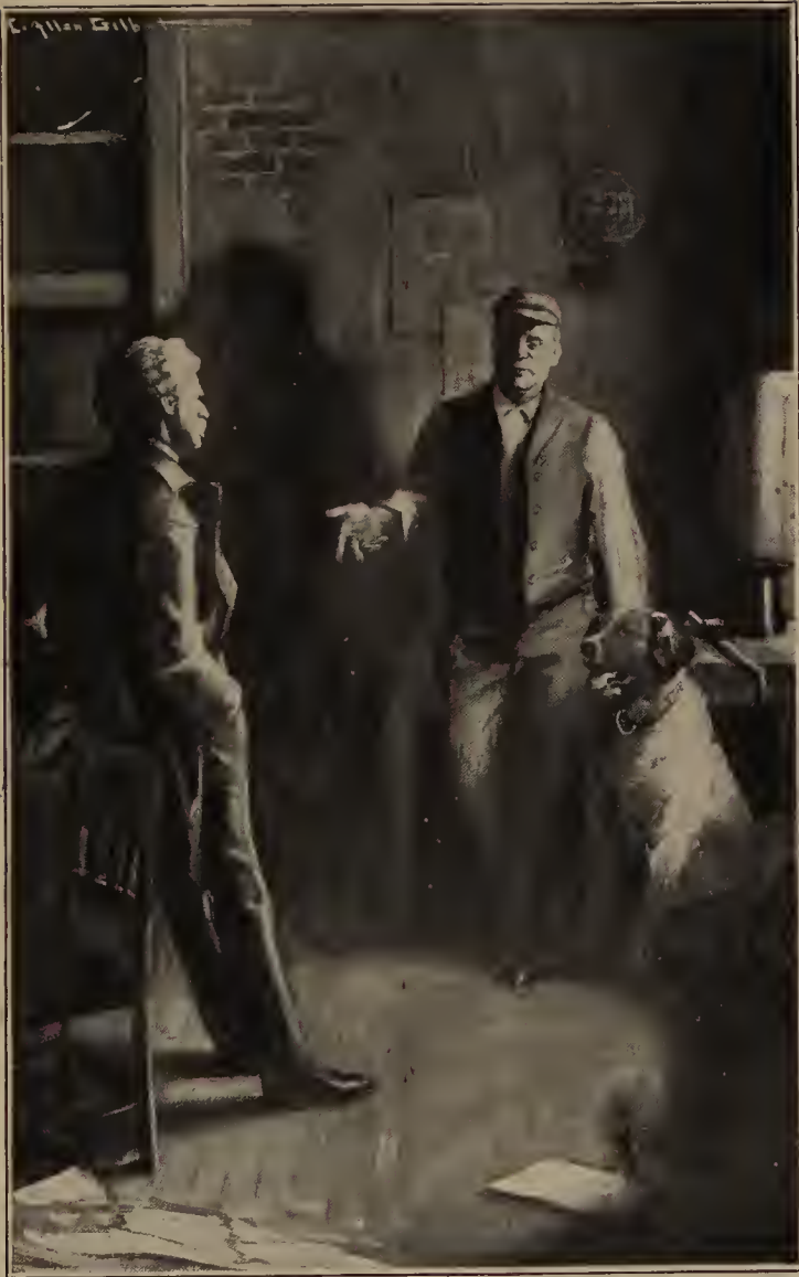
“YOUR HONOR’LL KNOW THAT DOG’S DIMENSIONS”