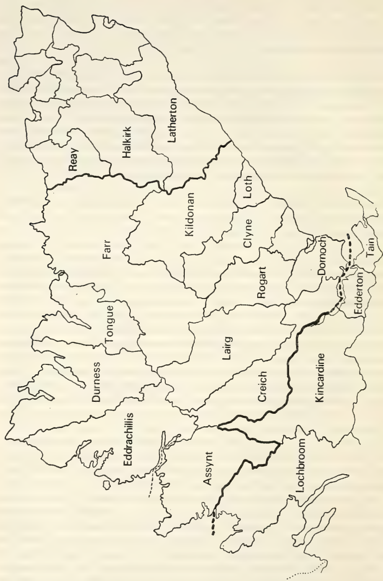
Fig. 2 County of Sutherland and adjacent counties with parish boundaries