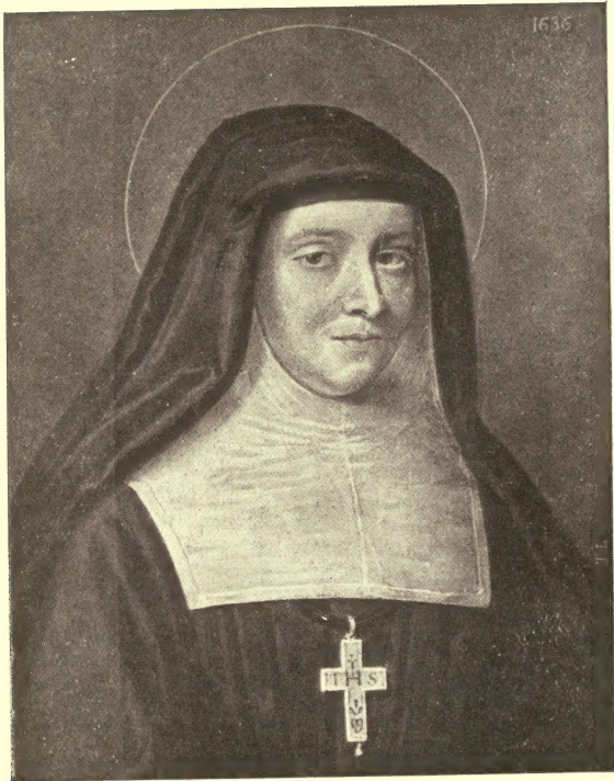
ST. JANE FRANCES DE CHANTAL.

(Foundress of the Order of the Visitation.)