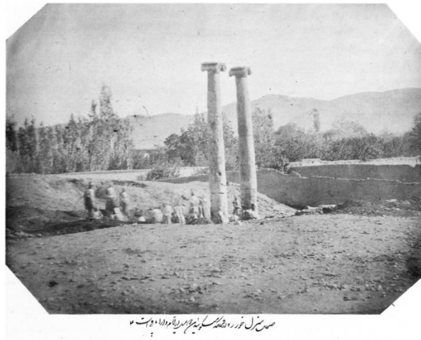
Figure 4. Photograph of the remains at Khorheh, Iran, taken by Āqā Rezā in 1859. Albumen print, 234 x 171 mm. Tehran, Golestan Palace Photothèque. Public domain image from Adle, 'Khorheh', pl. 3.

The first formal excavations in Persia were undertaken by Loftus at Susa between 1850 and 1852, which turned up relatively little in the way of identifiably Parthian material. 46 A second brief excavation, instigated by Naser al-Din Shah, took place in 1859 at Khorheh, southwest of Qom, a site originally interpreted as a