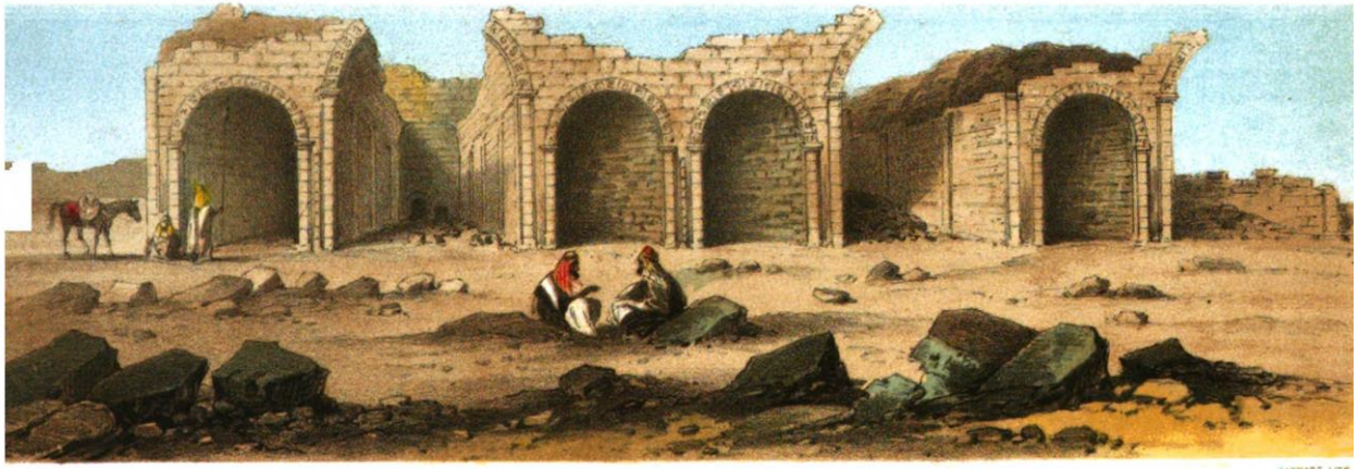
Figure 2. Frontispiece from Rawlinson, Sixth Oriental Monarchy (1877), depicting the ruins of Hatra, Iraq. Image in the public domain.

'Palace-Temple', at its centre. 21 These remains include three massive iwans and four smaller ones forming a single façade adorned with sculptural decoration (fig. 2). The iwan is a characteristic Parthian architectural form, which subsequently plays an important role in Sasanian and Islamic architecture well beyond Mesopotamia. 22 Although Rawlinson did not identify them as such, the iwans at Hatra are among the earliest known Parthian examples of this form.