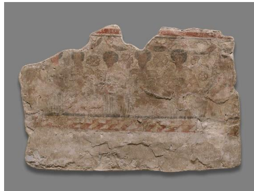
Figure 6. Dipinto picture and inscription from Dura-Europos, Syria, ca. 323 BCE-256 CE. Paint on plaster; 20.32 × 28.58 cm. Yale University Art Gallery, New Haven 1933.299.