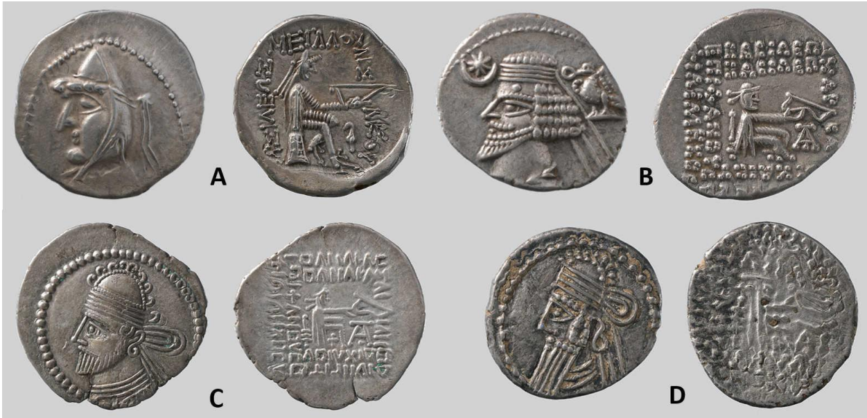
Figure 1. a: Silver drachm of Mithridates I, 171-138 BCE. Metropolitan Museum of Art, New York 99.35.2952. b: Silver drachm of Phraates IV, 38-2 BCE. Metropolitan Museum of Art, New York 99.35.2957. c: Silver drachm of Pacorus II, 78-110 CE. Metropolitan Museum of Art, New York 99.35.2961. d: Silver drachm of Vologases III, 147-191 CE. Metropolitan Museum of Art, New York 99.35.2963.