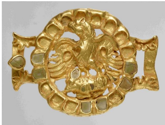
Figure 5. Belt adornment with an eagle and its prey, ca. 1st-2nd cen. CE. Gold with turquoise inlay; H. 6.3 cm, W. 8.7 cm. Metropolitan Museum of Art, New York 17.190.2055.

the French monopoly his research in Iran initially focused on rock reliefs and inscriptions, in which he sought to identify specific individuals known from textual sources. 61 For example, he reconstructed the name 'Mithridates' in the Greek inscription on one of the Parthian reliefs at Bisitun in order to link it to Mithridates II. 62 He subsequently extended this approach to other types of Parthian material, including unprovenanced objects he purchased or was shown during his travels. In one instance he argued that a pair of gold clasps in the form of eagles (fig. 5), which he believed to be part of a larger hoard attributed to Nahavand, belonged to the Parthian period because they exhibit both Greek and Achaemenid elements. He further connected this hoard to the Iranian noble family of Karin, which was based at Nahavand. 63 A more extreme case is his dating of the earliest architecture and murals at Kuh-e Khwaja to the Parthian period in order to link it with Kaspar, one of the biblical Magi, despite both its earlier identification as a Buddhist site and the clearly Sasanian character of the painted decoration. 64