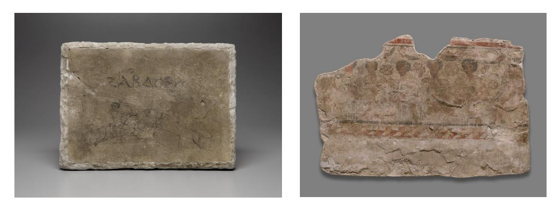
Figure 6. Dipinto picture and inscription from Dura-Europos, Syria, ca. 323 BCE-256 CE. Paint on plaster; 20.32 × 28.58 cm. Yale University Art Gallery, New Haven 1933.299. Public domain image from the Yale University Art Gallery.

Figure 7. Banquet scene from Dura-Europos, Syria, 194 CE. Paint on plaster; 148.6 × 183.5 × 12.7 cm. Yale University Art Gallery, New Haven 1938.5999.1147. Public domain image from the Yale University Art Gallery.