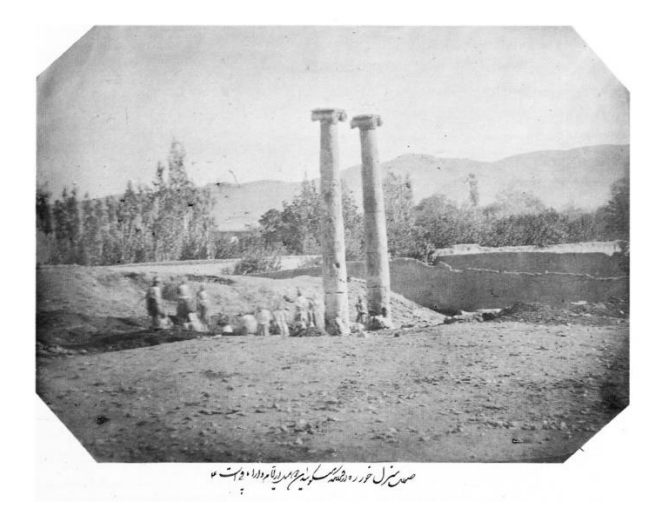
Figure 4. Photograph of the remains at Khorheh, Iran, taken by Āqā Rezā in 1859. Albumen print, 234 x 171 mm. Tehran, Golestan Palace Photothèque. Public domain image from Adle, 'Khorheh', pl. 3.

The first formal excavations in Persia were undertaken by Loftus at Susa between 1850 and 1852, which turned up relatively little in the way of identifiably Parthian material.<sup>46</sup> A second brief excavation, instigated by Naser al-Din Shah, took place in 1859 at Khorheh, southwest of Qom, a site originally interpreted as a