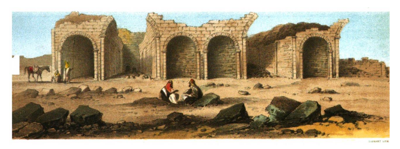
Figure 2. Frontispiece from Rawlinson, Sixth Oriental Monarchy (1877), depicting the ruins of Hatra, Iraq. Image in the public domain.

'Palace-Temple', at its centre.<sup>21</sup> These remains include three massive iwans and four smaller ones forming a single façade adorned with sculptural decoration (fig. 2). The iwan is a characteristic Parthian architectural form, which subsequently plays an important role in Sasanian and Islamic architecture well beyond Mesopotamia.<sup>22</sup> Although Rawlinson did not identify them as such, the iwans at Hatra are among the earliest known Parthian examples of this form.