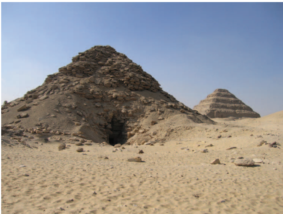
The 5 th Dynasty pyramid of Userkaf, with the 3 rd Dynasty pyramid of Djoser in the background, at Saqqara.