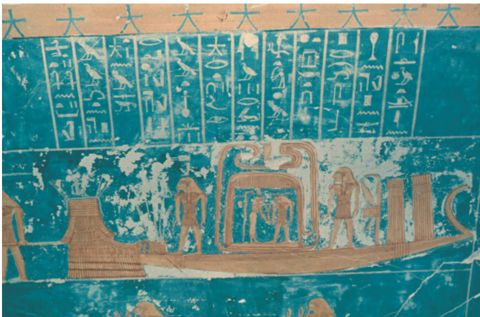
A scene from a Ramesside tomb in the Valley of the Kings showing the progress of the sun barque at night.