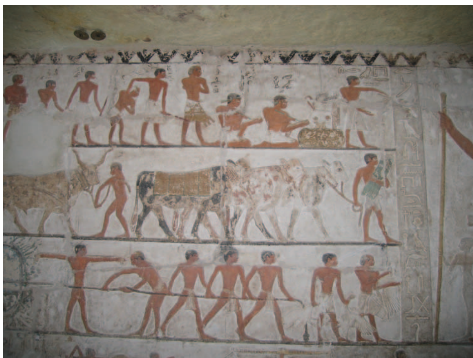
Agricultural and taxation scenes from the tomb of Nefer at Saqqara.

Cambridge University Press 978-0-521-67598-7 - Ancient Egypt: An Introduction Salima Ikram Frontmatter More information