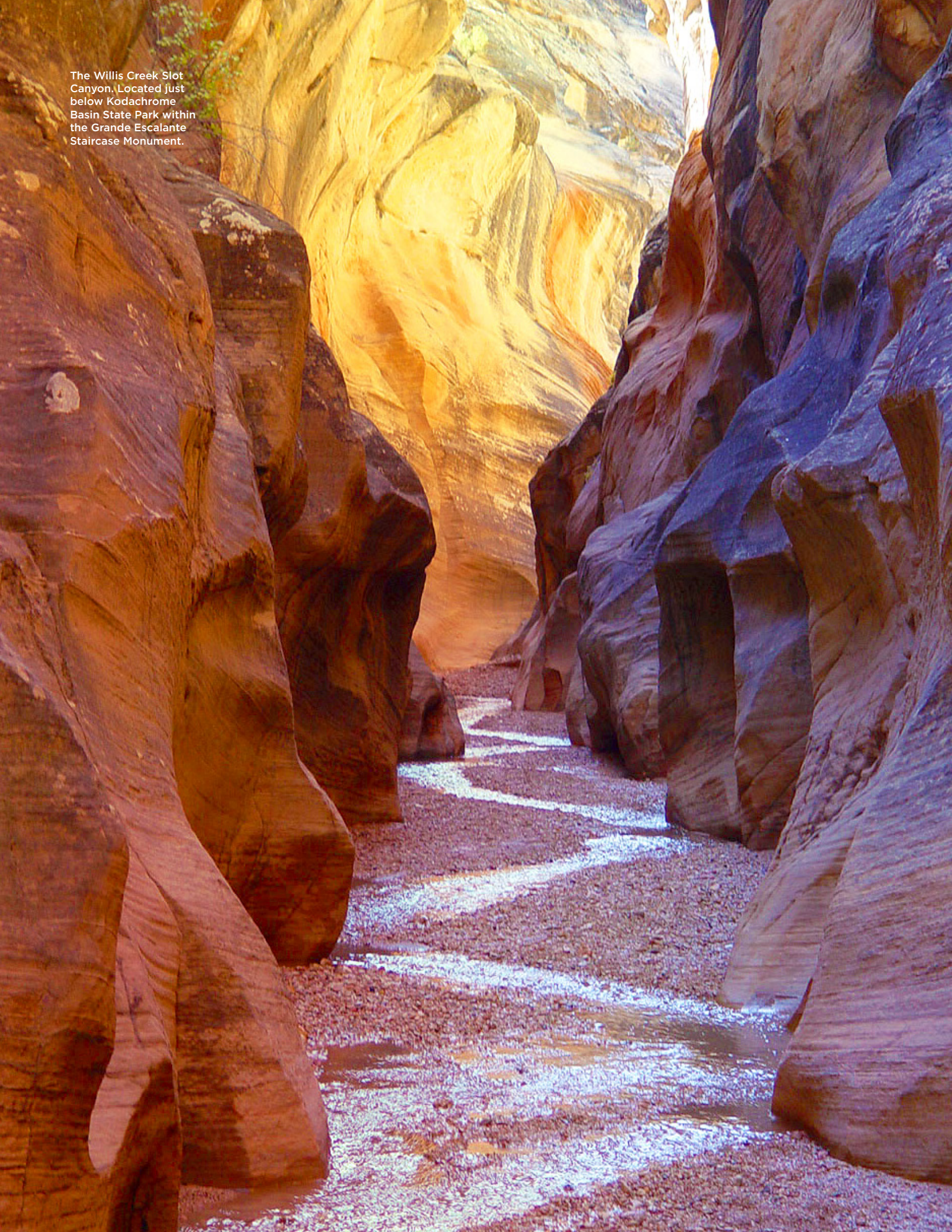
The Willis Creek Slot Canyon, Located just below Kodachrome Basin State Park within the Grande Escalante Staircase Monument.