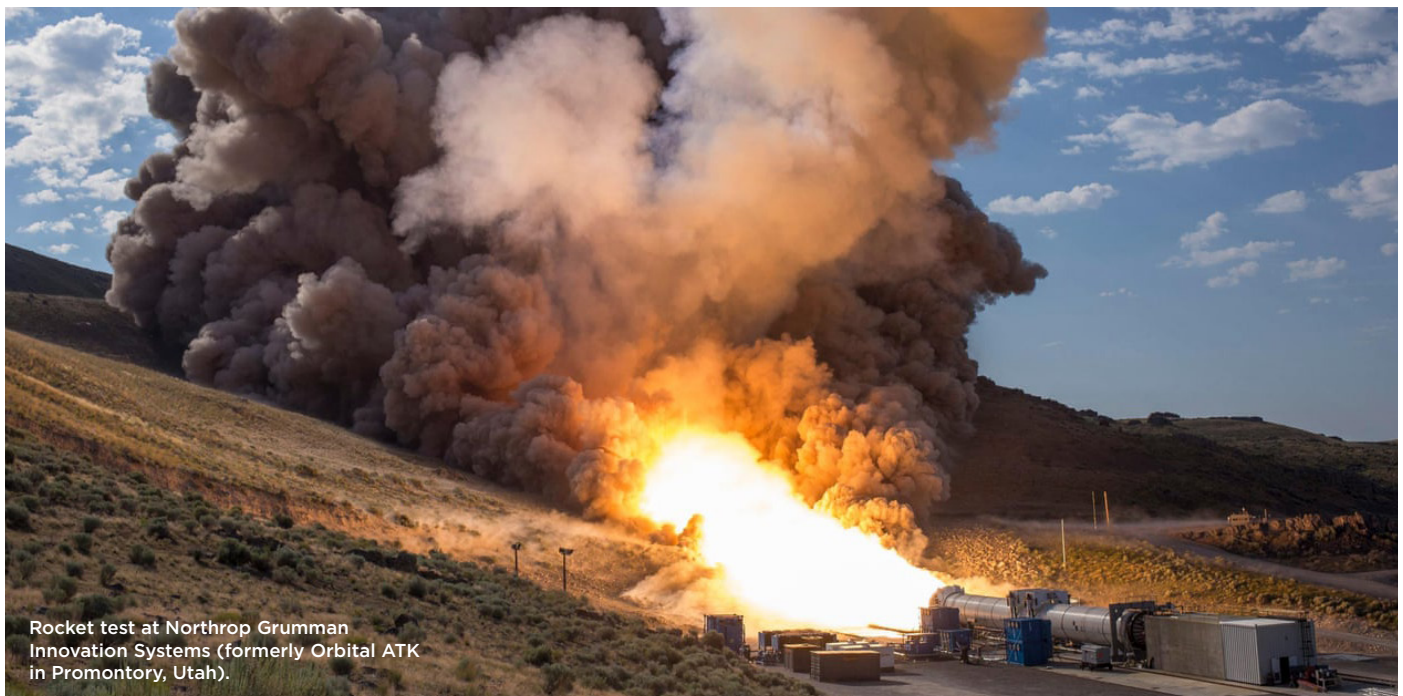
Rocket test at Northrop Grumman Innovation Systems (formerly Orbital ATK in Promontory, Utah).