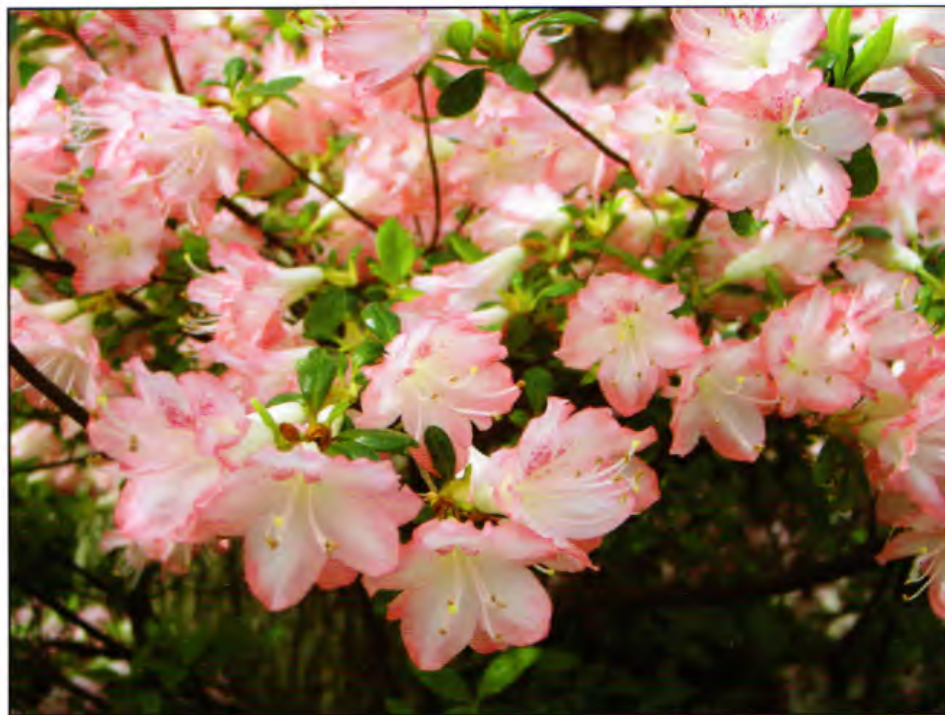
▲ Domoto's 'Cherryblossom' - 'Takasago'