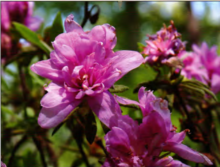
▼ R. yedoense var. yedoense

'Narcissiflorum' is still used, though, since a tuft of petaloid stamens in the flower center gives the appearance of a white narcissus blossom. To add to the confusion, there is an old Ghent deciduous azalea with double yellow flowers that also goes by the name 'Narcissiflorum'.