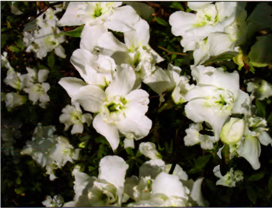
▲ Double Mucronatum 'Narcissiflorum'