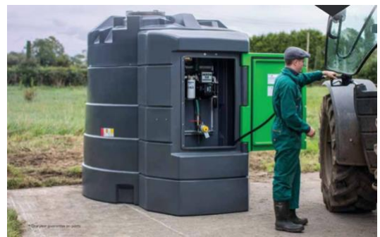
AdBlue Kingspan tank 2,000 liters with dispensing equipment