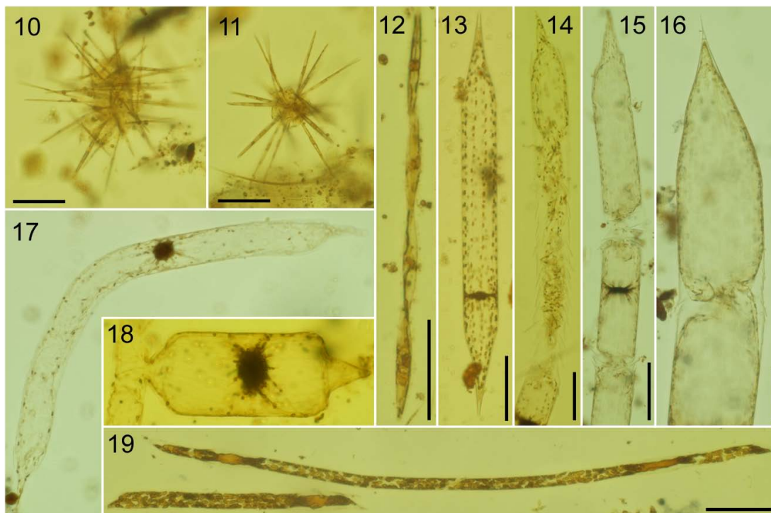
Figs. 10–19. Photomicrographs of microphytoplankton in the SE Pacific. (10–11) Clusters of Pseudo-nitzschia delicatissima , 20 m and 30 m depth. (12) Pseudo-nitzschia cf. subpacifica , 5 m depth. (13) “Normal” cell of Rhizosolenia bergonii , 60 m depth. (14) R. bergonii with fragmented frustule, 20 m depth. (10–14) 8°23′ S; 141°14′ W. (15) R. bergonii with fragmented frustule, 30 m depth. (16) Rhizosolenia acuminata , 5 m depth. (14–16) 9° S, 136°51′ W; 30 and 5 m depth). (17) Curved cells of R. bergonii (13°32′ S, 132°07′ W, 5 m depth). (18) Auxospore of R. bergonii , 33°21′ S, 78°06′ W, 5 m depth. (19) Highly pigmented cells of Rhizosolenia sp. (17°13′ S, 127°58′ W, 210 m depth). Scale bar = 100 \mu m.