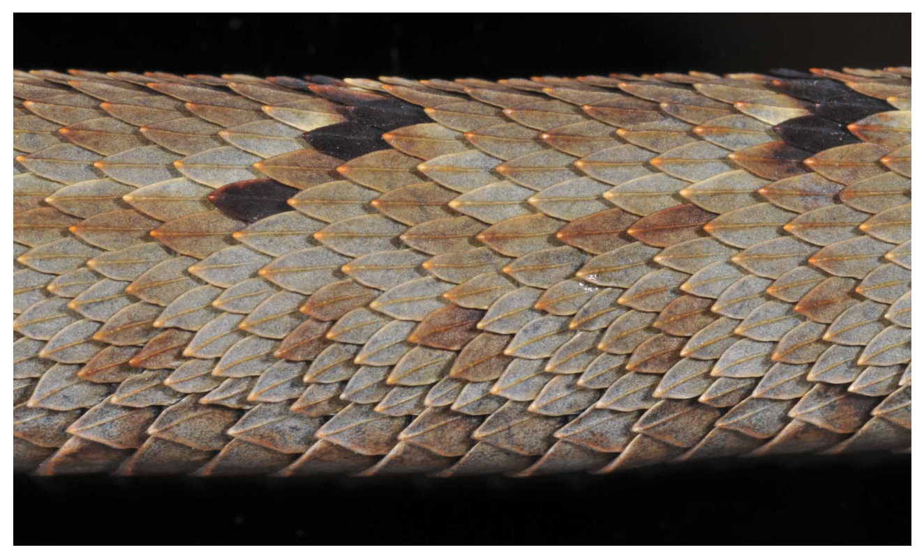
FIGURE 5. Midbody, right lateral view of Atheris mabuensis n. sp. (Holotype PEM R17901 Mount Mabu): note oblique orientation of lateral scale rows 1–5, and the progressive asymmetry in the shape and lack of serrated keels on these scales.

The species was locally common within the large tract of wet forest (>1000m) on Mount Mabu, and it was only observed within leaf litter on the forest floor (Fig. 6 top). Local hunters when interviewed confirmed this habitat preference, and also noted that the species remained small, growing to not much more than 35 cm in length. This observation was supported by the growth of the first specimen, which measured approximately 150 mm TL when first captured, and grew to only 367 mm TL after over three years in captivity despite regular feeding. Local hunters also noted that bites from the species were painful but not lethal. Caution is still advised because serious envenomation has followed bites from A. chlorechis (Rödel, 1999; Top et al. , 2006) and A. squamigera (Mebs et al. , 1998), and even a death from the latter (Lanoie and Branch, 1991).