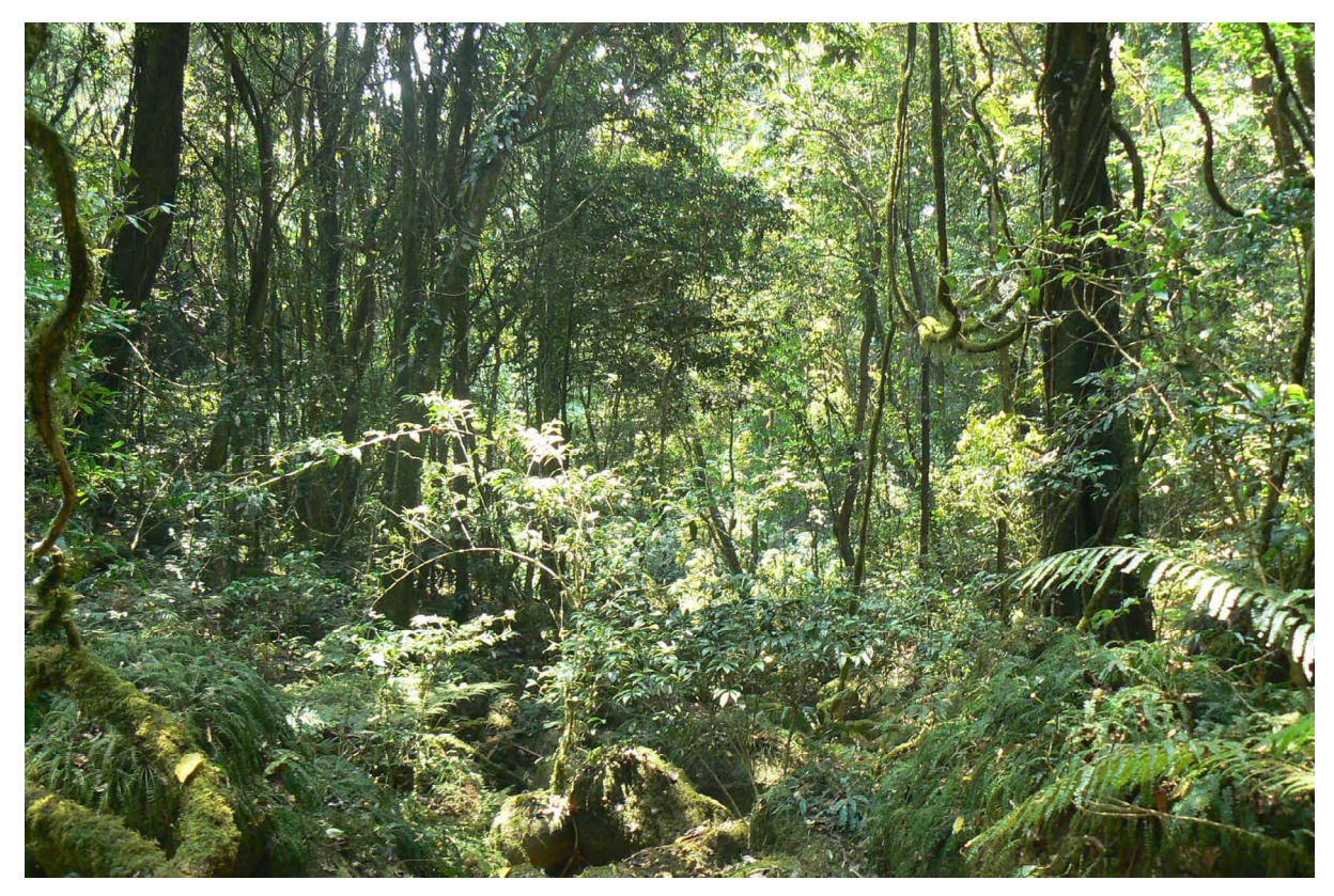
FIGURE 9. Closed-canopy forest habitat around the main camp, Mount Mabu, northern Mozambique. The type series of Atheris mabuensis was collected in leaf litter on the forest floor (photograph J. Bayliss).

FIGURE 8. General view of closed-canopy, mid-altitude forest habitat on Mount Mabue, northern Mozambique. The central valley includes the main camp from whose surroundings the type series of Atheris mabuensis were collected (photograph J. Bayliss).