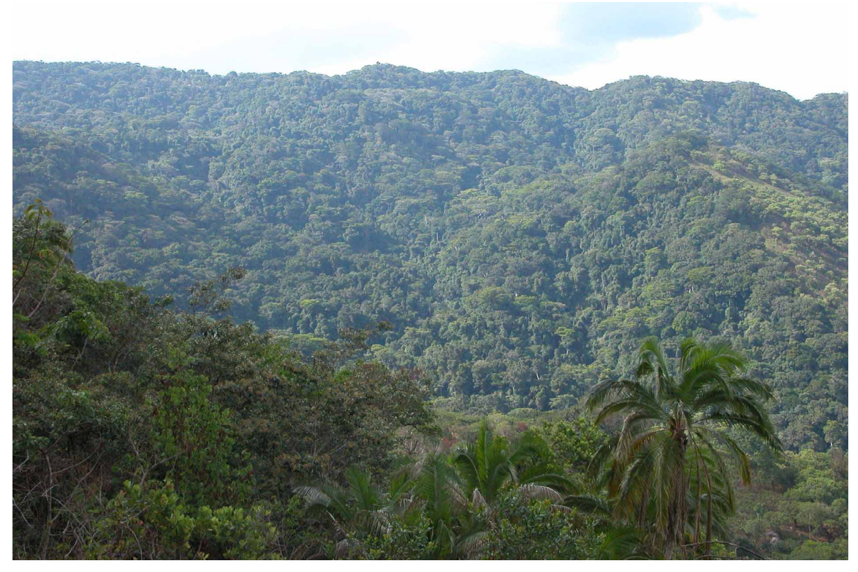
FIGURE 8. General view of closed-canopy, mid-altitude forest habitat on Mount Mabue, northern Mozambique. The central valley includes the main camp from whose surroundings the type series of Atheris mabuensis were collected.