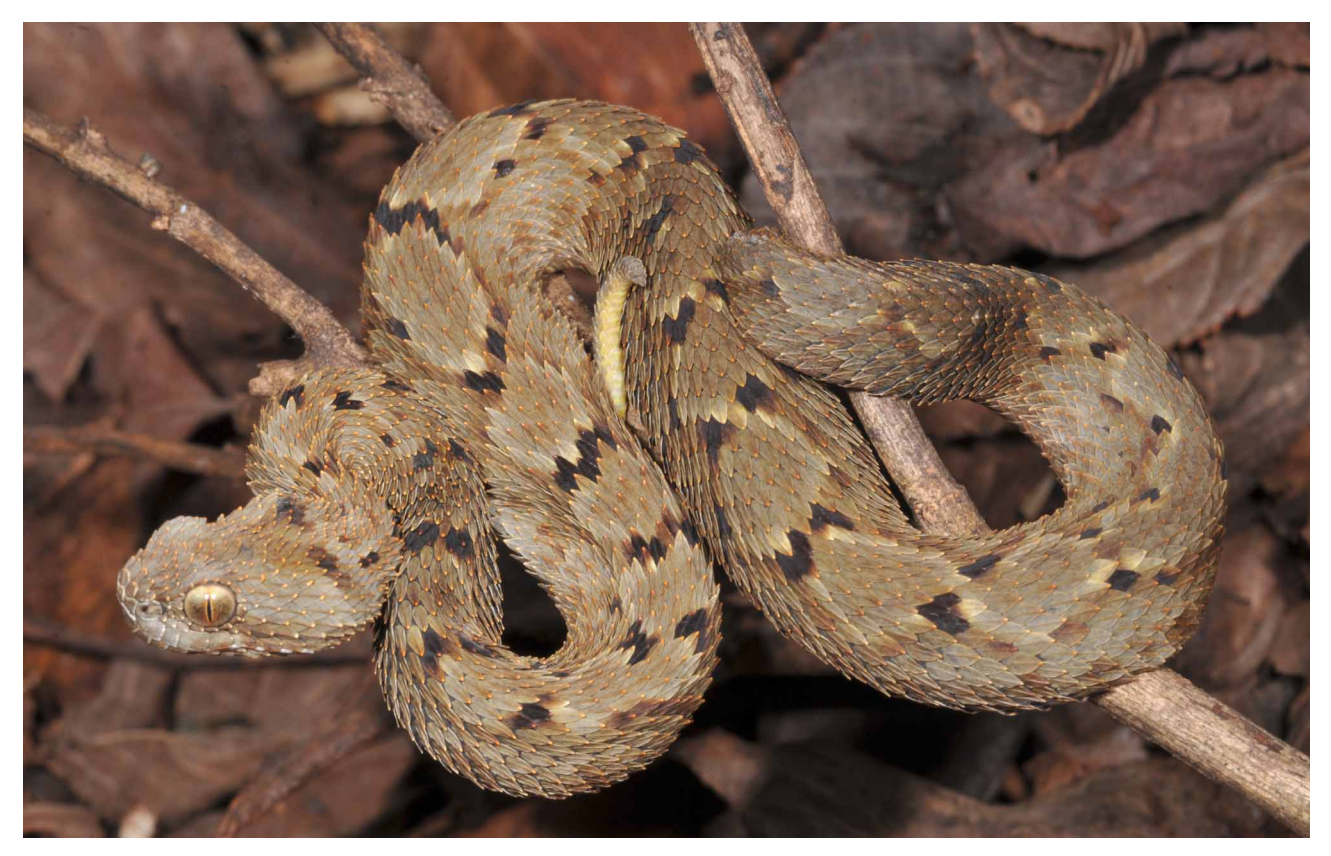
FIGURE 4. Atheris mabuensis n. sp. (Holotype PEM R17901, Mount Mabu) in life showing habitus and general colouraion. Note: Retention of yellow tail tip in adult.

Distribution: Known only from the type locality, Mount Mabu, and adjacent Mount Namuli, both montane isolates in northern Mozambique.