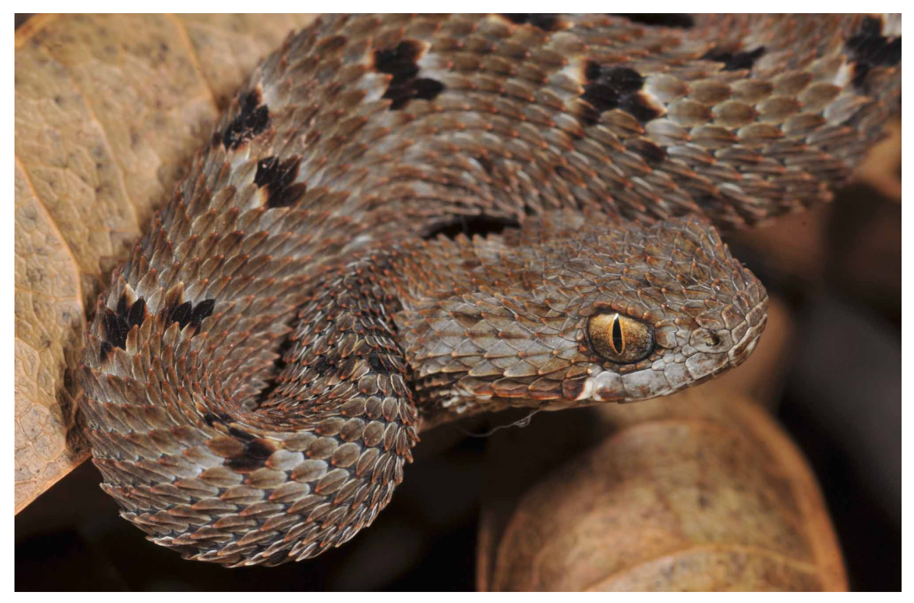
FIGURE 7. Right lateral view of head and forebody Atheris mabuensis n. sp. (PEM R17904, Mount Namuli): note reduction of gold tipped scales on head and body.

overview of the genus. The southern limit of the genus in the east is reached by A. rungweensis , recorded from northern Malawi (Misuku Forest; Loveridge, 1953) and adjacent Zambia (Broadley, 1998). In the west, A. squamigera has been recorded from northern Angola (Laurent, 1964), with a southern record provisionally assigned to the species photographed from Cangandala-Calandula (Pedro vas Pinto, pers. comm. January 2009).