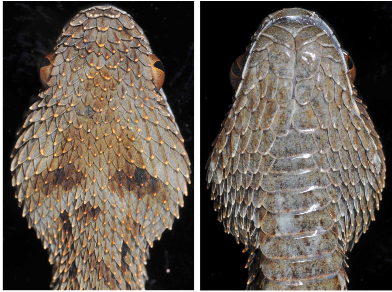
FIGURE 3. Dorsal (left) and ventral (right) views of the head of Atheris mabuensis n. sp. (Holotype PEM R17901, Mount Mabu) before fixation. Note the poorly-defined dark V-patch on crown of head

Hemipenis : Both hemipenes have only partially everted, despite the rector muscles having been cut through a small lateral incision in subcaudals 13–17; the basal portion of the hemipenis reveals a typically divided organ with a number of basal spines on the lateral surfaces, and indications of a distal calyculate zone (this needs confirmation on fully everted hemipenes).