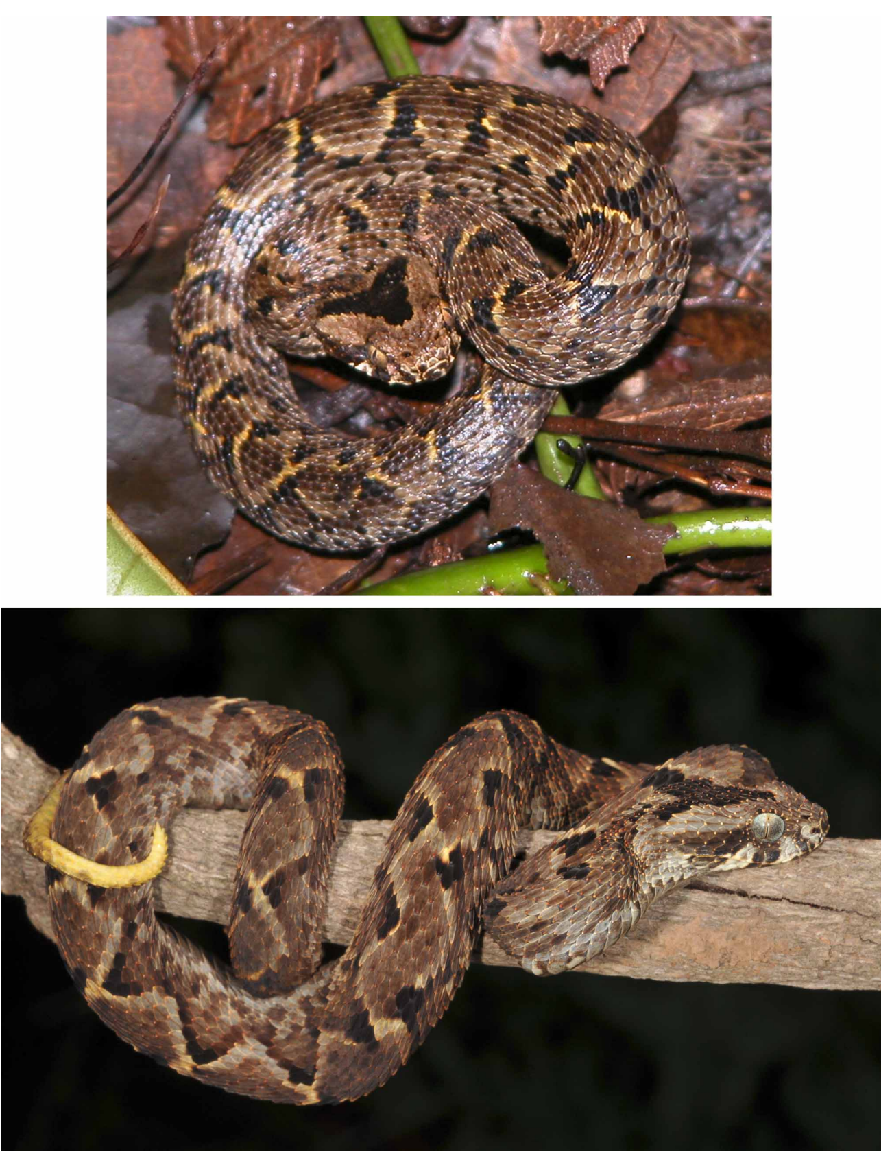
FIGURE 6. Atheris mabuensis n. sp. (PEM R17910): Top - small juvenile (<150mm TL) photographed in situ on capture (25 January 2006); note drab colouration imparting camouflage in habitat among leaf litter on forest floor. Bottom – same specimen (photographed 19 Nov 2008, after 34 months in captivity); note retention of juvenile colouration, particularly yellow tail tip, and development of gold tips to the keels on the head and forebody scales.