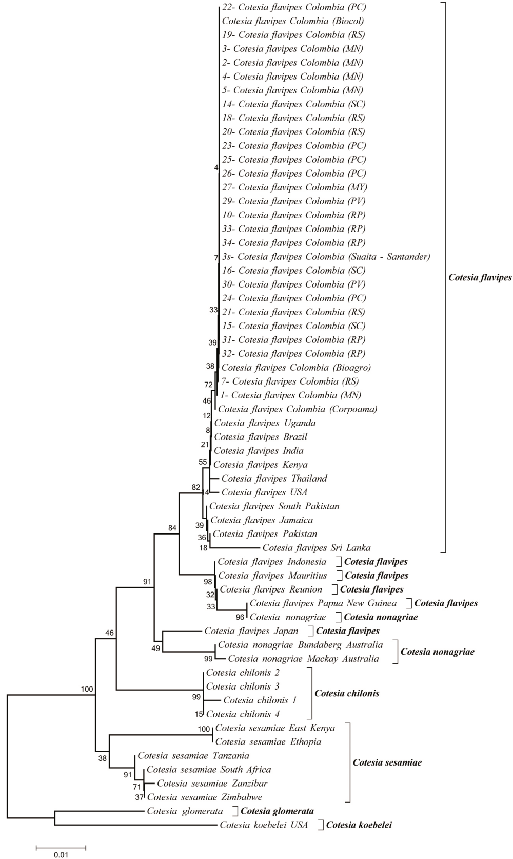
Fig. 1. Neighbor-joining tree generated under the Kimura 2-parameter (K2P) nucleotide substitution model. The percentage of replicate trees in which the associated taxa clustered together in the bootstrap test (1,000 replicates) is shown next to the branches. Abbreviations for sugarcane mills in Colombia's Cauca River Valley are as follows: Manuelita (MN), Mayagüez (MY), Pichichí (PC), Providencia (PV), Riopaila (RP), Risaralda (RS), Sancarlos (SC). GeneBank C. flavipes accessions: Uganda - JQ396735.1, Brazil - DQ232320.1, India - DQ232336.1, Kenya - DQ232317, Thailand - DQ232340.1, USA - DQ232330.1, South Pakistan - JQ396714.1, Jamaica - DQ232321.1, Pakistan - DQ232335.1, Sri Lanka - DQ232327.1, Indonesia - DQ232337.1, Mauritius - DQ232319.1, Reunion - DQ232329.1, Papua New Guinea - DQ232316.1.