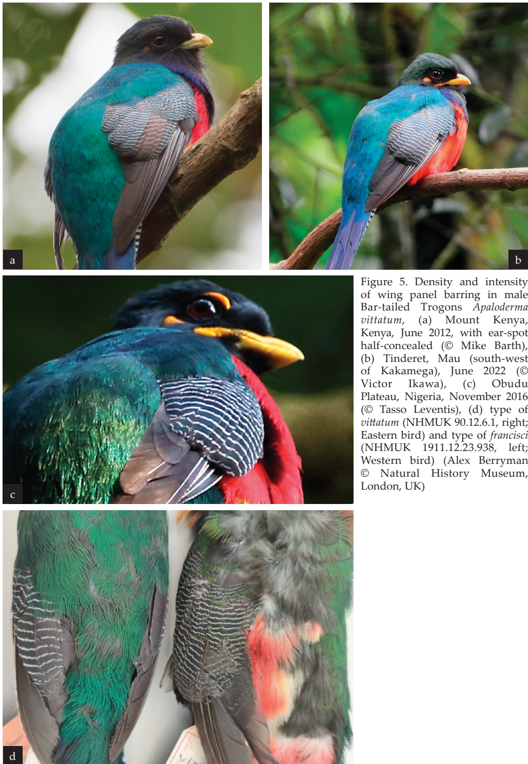
Figure 5. Density and intensity of wing panel barring in male Bar-tailed Trogons Apaloderma vittatum, (a) Mount Kenya, Kenya, June 2012, with ear-spot half-concealed, (b) Tinderet, Mau (south-west of Kakamega), June 2022, (c) Obudu Plateau, Nigeria, November 2016, (d) type of vittatum (NHMUK 90.12.6.1, right; Eastern bird) and type of francisci (NHMUK 1911.12.23.938, left; Western bird)