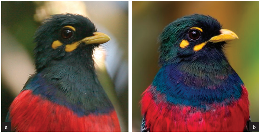
Figure 3. Bill colour and bare facial skin in male Bar-tailed Trogons Apaloderma vittatum , (a) Obudu Plateau, Nigeria, December 2004, (b) Bioko, February 2019

chin to mid-belly and hence slightly smaller pink belly patches than Central and Western females (Table 1). Eastern birds have longer wings and tails than Central birds, which in turn have longer wings and tails than Western birds (Table 1). It is curious that Central birds have slightly shorter bills than Eastern and Western birds; the fact that both sexes show this suggests the difference is real. It is also curious that in many photographs Eastern birds appear to have smaller bills than either Central or Western birds; this seems to be the product of the latter having less feathering at the base of the mandible.