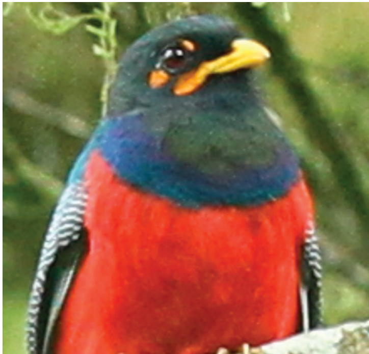
Figure 4. Male Bar-tailed Trogon Apaloderma vittatum showing yellow supraocular mark (spot or line?), Buhoma, Uganda, October 2013

chin to mid-belly and hence slightly smaller pink belly patches than Central and Western females (Table 1). Eastern birds have longer wings and tails than Central birds, which in turn have longer wings and tails than Western birds (Table 1). It is curious that Central birds have slightly shorter bills than Eastern and Western birds; the fact that both sexes show this suggests the difference is real. It is also curious that in many photographs Eastern birds appear to have smaller bills than either Central or Western birds; this seems to be the product of the latter having less feathering at the base of the mandible.