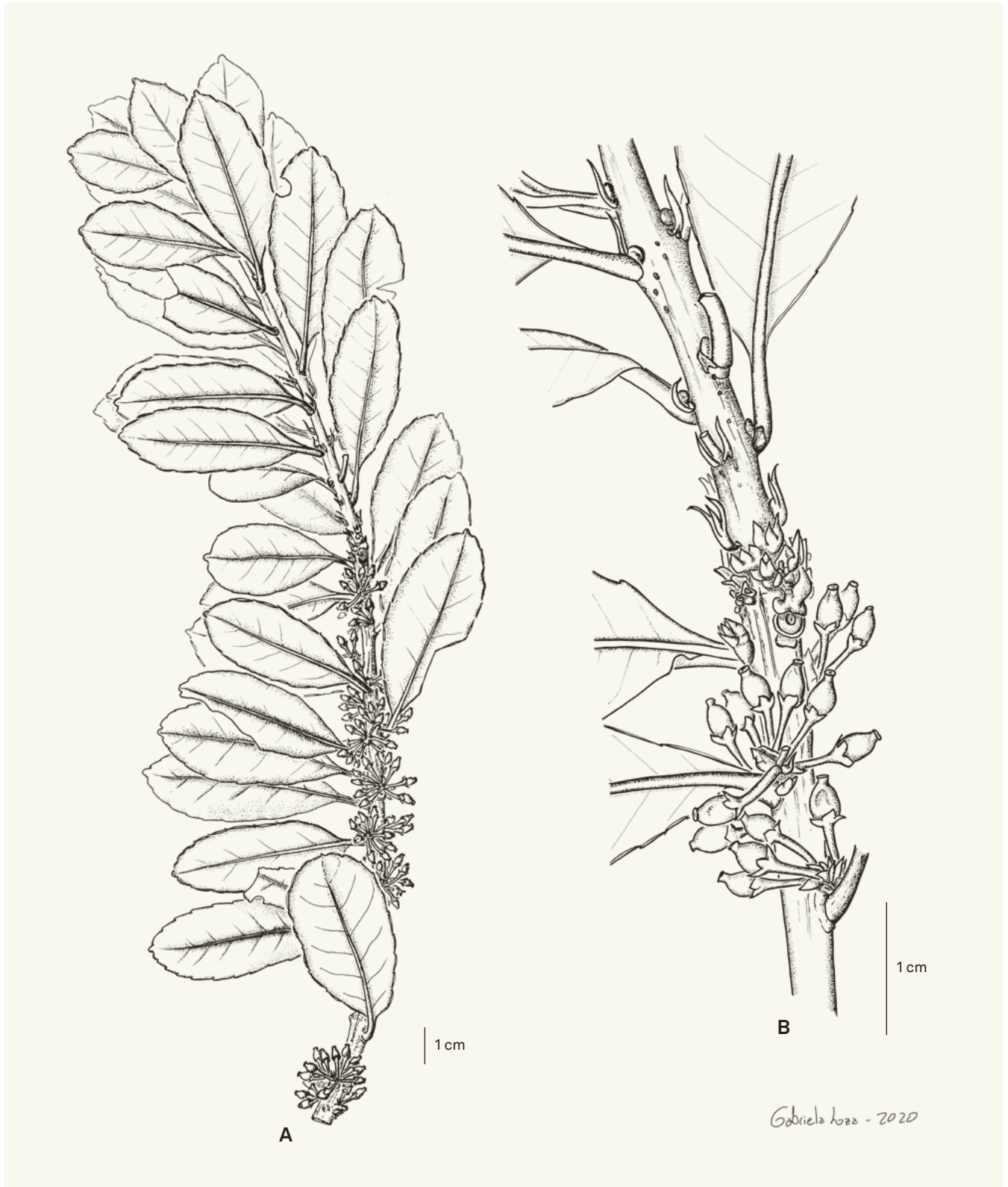
Fig. 9. – Ilex laurina var. tenuifolia Barriera. A. Female branchlet; B. Details of the inflorescences (corollas dropped). [Neill et al. 13710, G] [Drawings: Gabriela Loza]