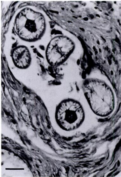
FIGURE 1. Larval Physocephalus sp. within a chronic granulomatous cyst in the stomach of the blue spiny lizard, Sceloporus serrifer . H&E. Bar = 100 \mu m.