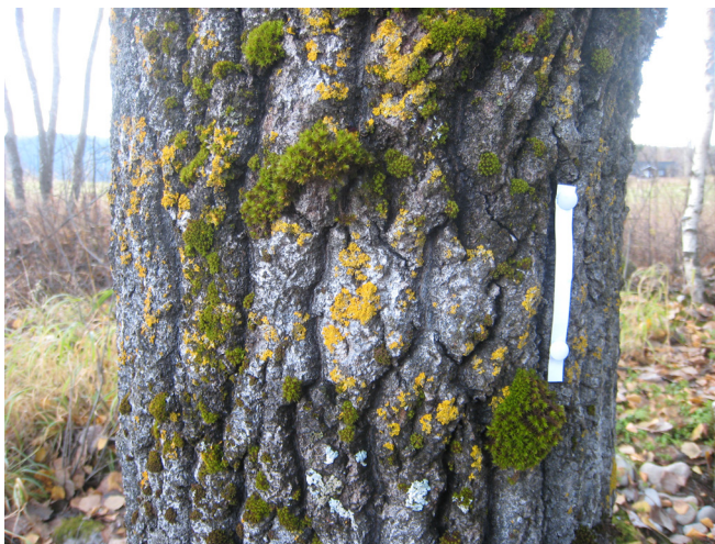
Figure 1. A Physcietalia vegetation with a large cover of Orthotrichetalia moss species, or an Orthotrichetalia vegetation invaded by Physcietalia lichen species? We prefer an integrated approach with both bryophytes and lichens included: several moss species ( Lewinskya speciosa , Nyholmia obtusifolia (both species formerly in the genus Orthotrichum , hence the name Orthotrichetalia ; Goffinet et al. 2004, Sawicki et al. 2010, Lara et al. 2016), Pylaisia polyantha ) and many lichen species ( Athallia pyracea , Caloplaca cerina , Candelariella xanthostigma , Myriolecis dispersa , Phaeophyscia orbicularis , Physcia adscendens , P. aipolia , P. stellaris , Toniniopsis subincompta , Xanthoria parietina ) were identified in an Orthotricho-Physcietea vegetation on a Populus tremula trunk (Koppang, Norway 2020). The length of the scale bar (white piece of paper) is 10.0 cm.

Many bryophyte and lichen species share the same habitat and substrate and are subject to the same (a)biotic conditions. Therefore, whenever possible, we integrated bryophyte and lichen syntaxonomy. As a result, our choice of syntaxa and syntaxon names fits the Dutch situation well but is not always in accordance with the International Code of Phytosociological Nomenclature (ICPN) (Weber et al. 2000). To illustrate this, we combined the ‘bryophyte class’ Frullanio dilatatae-Leucodontetea sciuroidis Mohan 1978 and the ‘lichen class’ Physcietea Tomaselli and De Micheli 1952 into one integrated class divided into the bryophyte-dominated order Orthotrichetalia Hadač in Klika and Hadač 1944 (originating from the Frullanio-Leucodontetea ) and the lichen-dominated order Physcietalia Hadač in Klika and Hadač 1944 (originating from the Physcietea ). According to the ICPN, the new name should be: Physcietea Tomaselli and De Micheli 1952. As in our integrated class both bryophyte and lichen species play a more or less equally important role, we combined both the original class names into the new name Orthotricho-Physcietea Tomaselli and De Micheli 1952 (Fig. 1), although not valid according to the ICPN. Why we chose to follow the ICPN in specific cases, and why we chose to divert from it in many other cases, is extensively