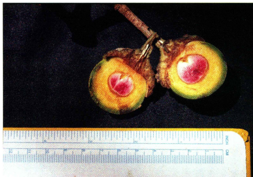
FIG. 2. Section of fruit and cupule of Ocotea heribertoii (from the type collection).

TREES to 40 m, diam. above buttresses to 90 cm; buttresses medium-sized but well developed; unweathered bark cream (bronze in smaller trees) with abundant spaced darker warts often more or less in vertical rows, in parts with darker exfoliating thick scales a few inches across; slash of bark aromatic, ca. 1 cm thick, in large trees pale to medium cinnamon-colored with fine vertical orange short lines (these not prominent), quickly oxidizing through a medium orange-brown to a medium chocolate-brown; sapwood yellowish-cream. YOUNG TWIGS smooth, sparsely to densely strigillose with distally-directed hairs to 0.1 mm long, usually soon glabrate, 1.5–3 mm thick, lightly ridged below petiole insertions; apical bud 3–5 mm long, lanceolate, densely minutely pale golden-silver sericeous; axillary buds of vigorous shoots with similar vestiture, lanceolate, laterally flattened, minute to 2.5 mm; older twigs grey, smooth to irregular, shiny where