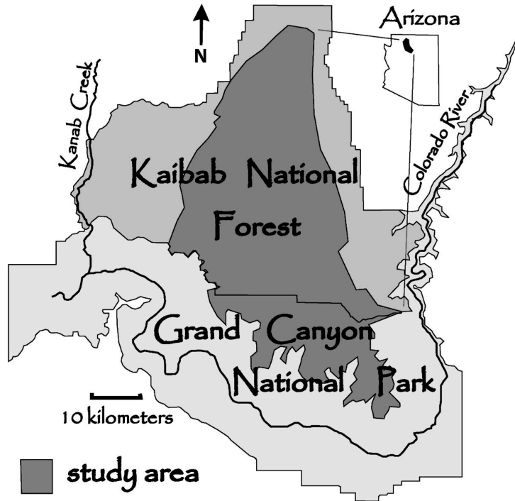
Fig. 1. Map showing the vicinity of the Kaibab Plateau and the area studied.

The lower elevational limit for this checklist is somewhat arbitrary, with the intention of capturing the unique flora of the upper elevations of the KP and lower portion of the ponderosa pine–Douglas-fir communities. By so doing, we included steep xeric and mesic terrain below the rim as well as hanging gardens. With the exception of the higher regions of the Powell Plateau, high buttes or mesas within GRCA were not included. The boundary of our study area (Fig. 1) is well defined by the upper portions of the rim of the Grand Canyon; where that rim falls below the ponderosa pine zone on the west, our boundary follows the Winter Road (FRs 425, 427, and 423 to FR 22). The boundary continues, making a northern arc with a radius of 8–10 km around Jacob Lake at the lower level of the ponderosa pine zone to the East Side Game Road (FR 220), through Saddle Mountain Wilderness and to the east rim of the KP. Although Rasmussen (1941) places the lower elevational limit of the KP at 1830 m (6000 ft) with an area of 95 km (60 mi) by 55 km (35 mi) and 2980 km 2 (1152 mi 2 ), our study area is ca. 1880 km 2 (725 mi 2 ).