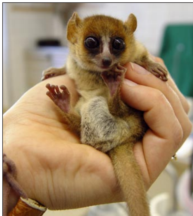
Figure 3. Microcebus lehilahytsara .

The exact distribution area for M. lehilahytsara has still to be assessed. Currently, it is known only from the type locality of Andasibe and surrounding regions (for example, Maromizaha Forest; Randrianambinina and Rasoloharijona 2006), including the two protected areas Analamazotra Special Reserve and Mantadia National Park (Kappeler et al. 2005; Mittermeier et al. 2006) (Fig. 1). The extent of the distribution of this species to the south and north is still unknown. Based on currently available information, it is unlikely that Goodman’s mouse lemurs occur in sympatry with other mouse lemur species. The maximum extent of its range to the south may be Ranomafana National Park, where it is replaced by M. rufus , and to the north to the Betampona Strict Nature Reserve and Zahamena Strict Nature Reserve