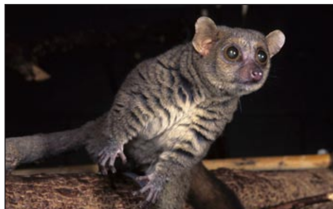
Figure 2. Mirza zaza.