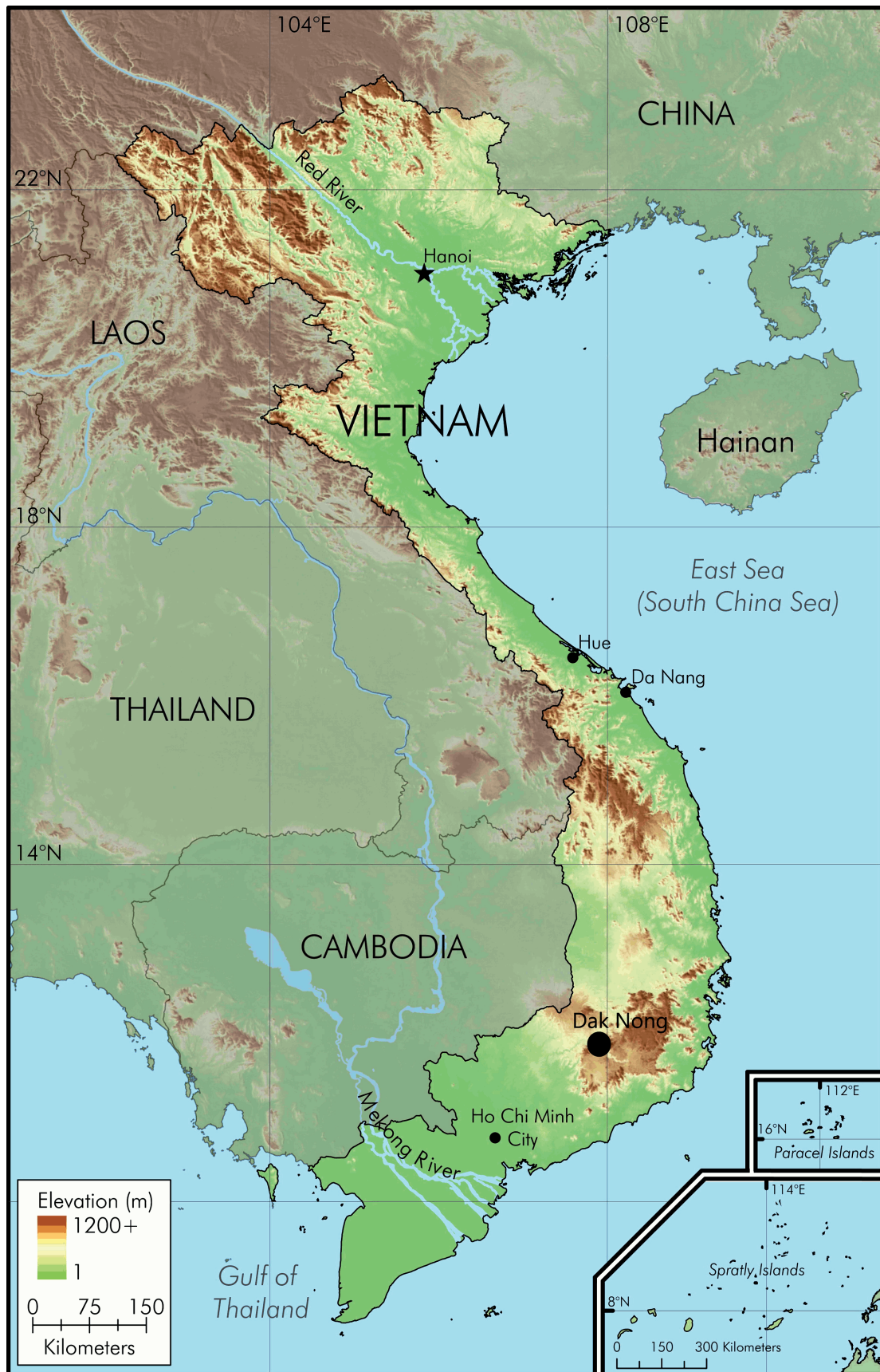
Fig. 5. Map of Vietnam with the type locality (large black dot) of Calamaria dominici sp. nov. in Ta Dung Nature Reserve, Dak Nong Province.