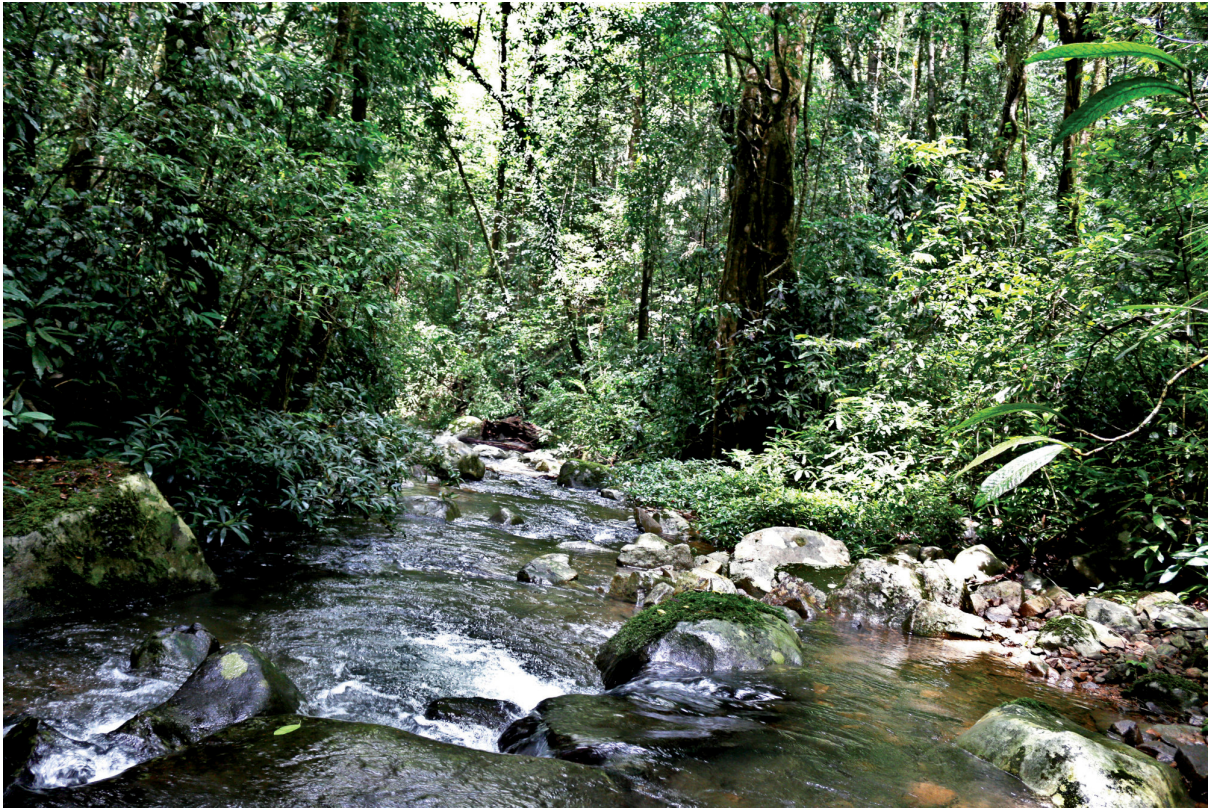
Fig. 6. Ta Dung Nature Reserve, Dak Nong Province, Central Highlands, Vietnam.