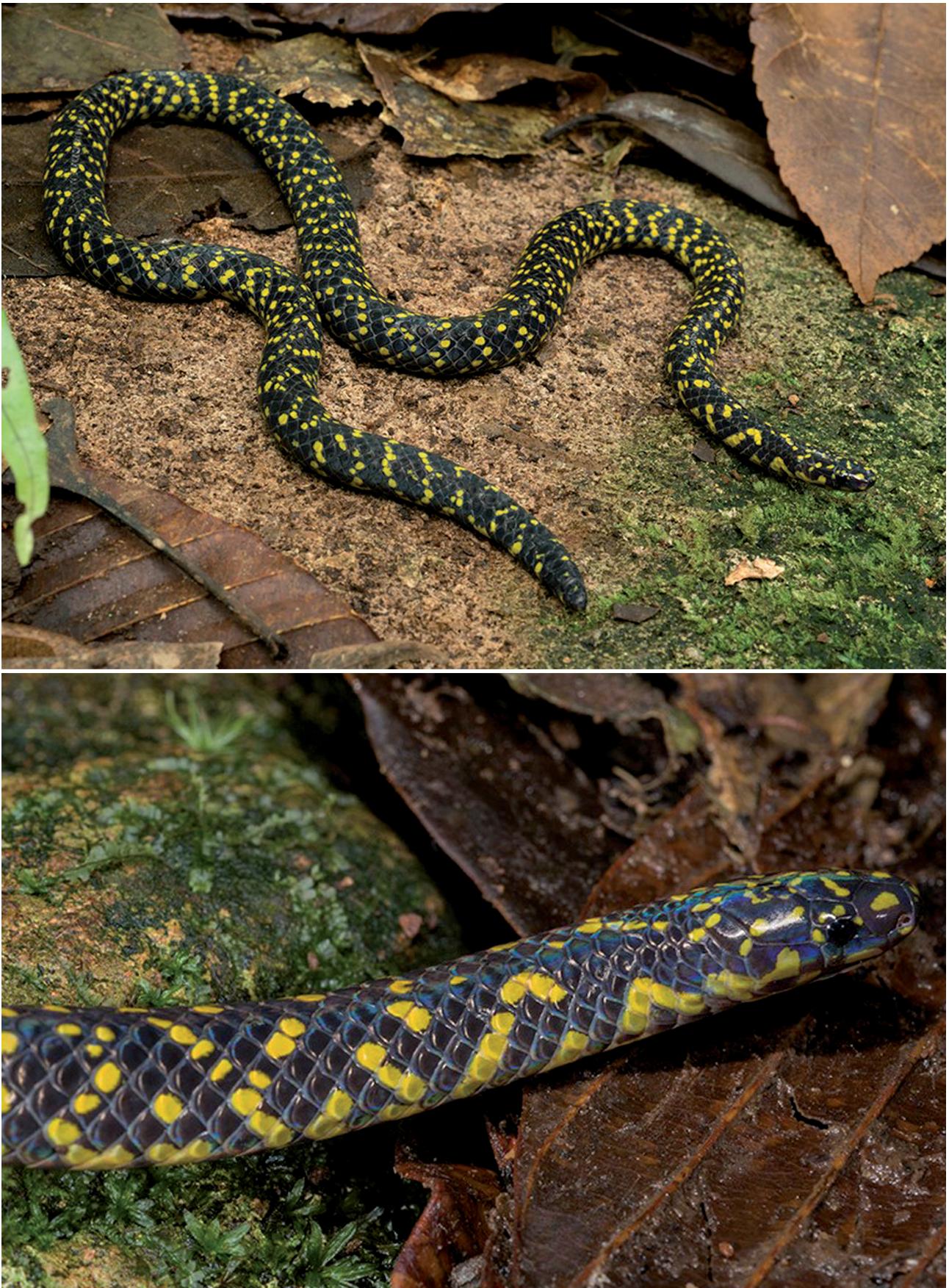
Fig. 1. Holotype of Calamaria dominici sp. nov. (IEBR R.2018.1) in life.