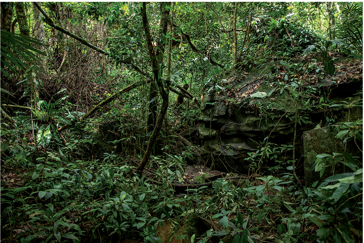
Fig. 7. Habitat of Calamaria dominici sp. nov. in Ta Dung Nature Reserve, Dak Nong Province, Central Highlands, Vietnam.