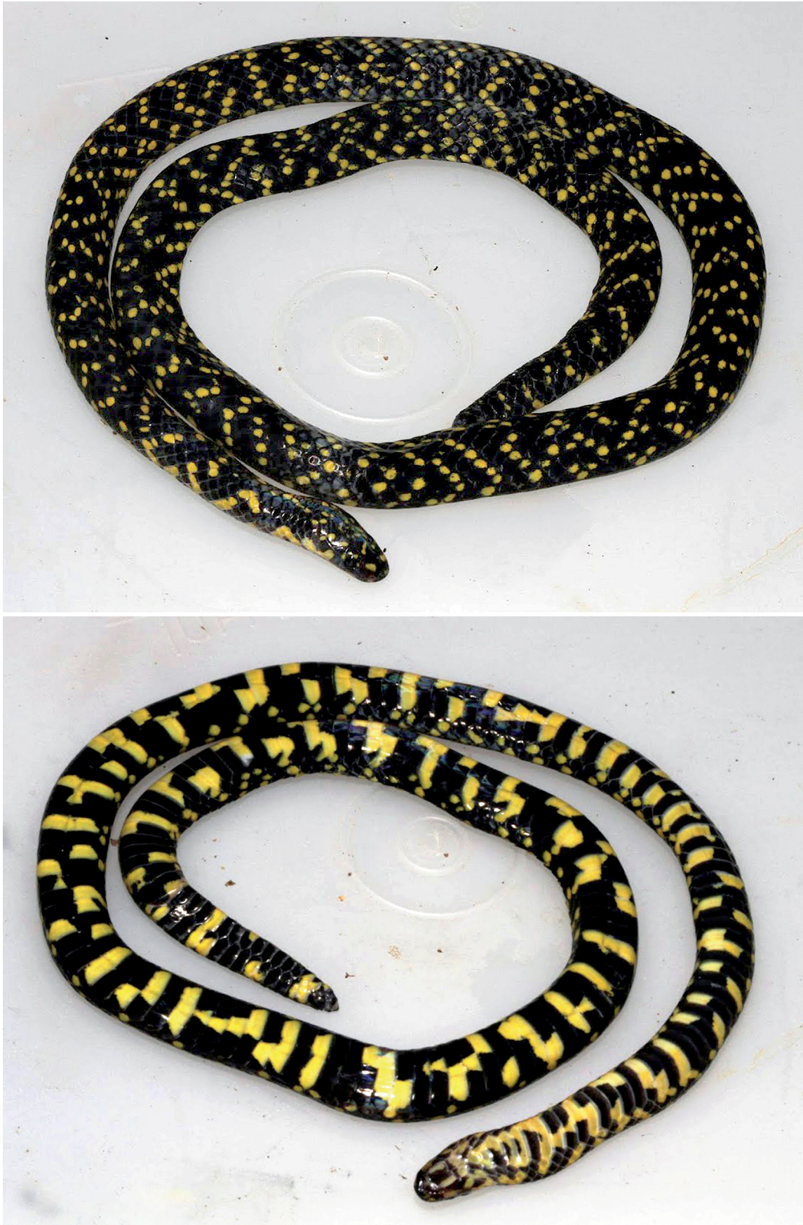
Fig. 4. Dorsal and ventral views of the holotype of Calamaria dominici sp. nov. (IEBR R.2018.1).