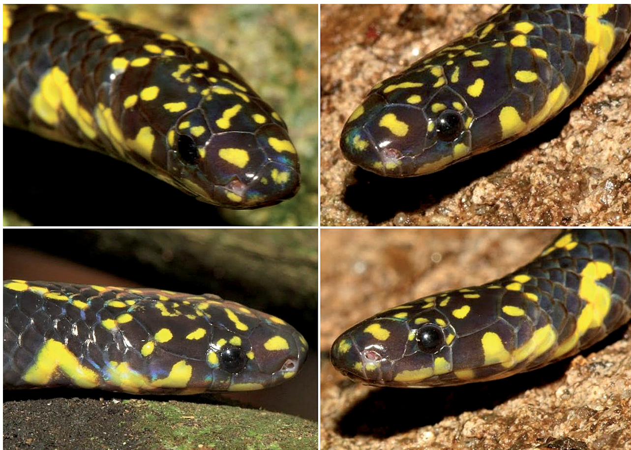
Fig. 2. Head views of the holotype of Calamaria dominici sp. nov. (IEBR R.2018.1) in life. Photos R. W. Van Devender.

Calamaria dominici sp. nov. further differs from the