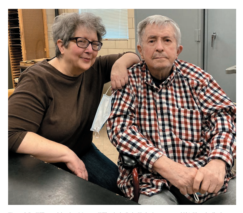
Figure 5. Dr. Wilbur and daughter Margaret Wilbur in the Duke Herbarium, summer 2021.

Regarding plant nomenclature, Wilbur was a stringent rule-follower, and as with other aspects of his botanical work, he was knowledgeable and rigorous. He was not enamored with formal conservation of generic names, and he was uncomfortable with the conservation of species names. He offered one of the few formal classes available then in plant nomenclature, at the graduate level. This was a well-organized pass through the Code of Botanical Nomenclature, as it was then called, which he considered essential for training in plant taxonomy.