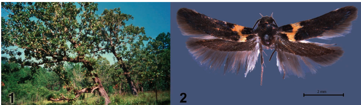
Fig. 1. Type locality of Euclementia barksdaleella n. sp. Lee and Brown at Barksdale A.F.B., with Quercus stellata and in foreground. Fig. 2. Adult photo of Euclementia barksdaleella n. sp. Lee and Brown. Scale bar: 2 mm.

Larvae of both E. bassettella and E. schwarziella are parasitoids of scale insects, specifically Kermes spp. and Allokermes kingii (Cockerell) (Hemiptera: Kermesidae)