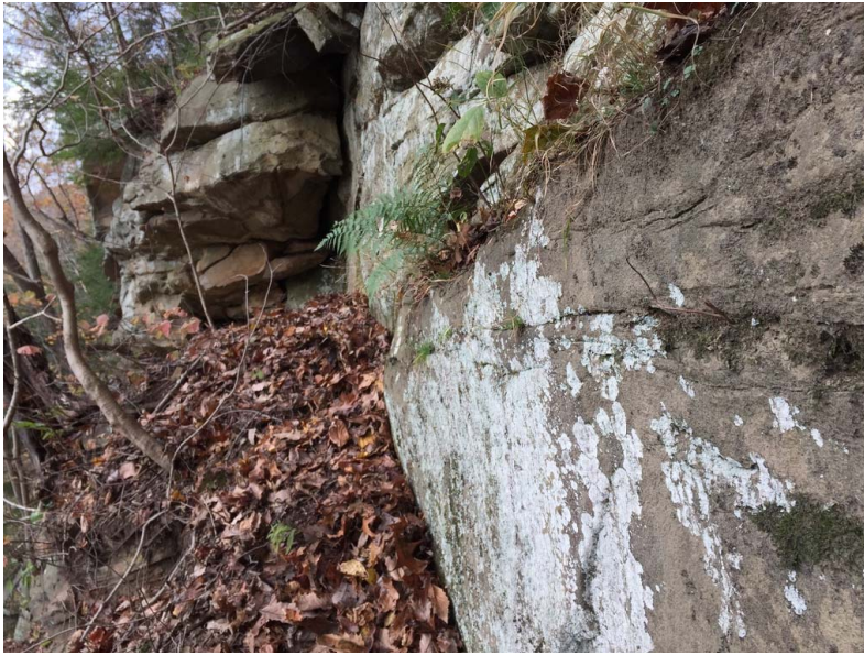
FIG. 3. Sandstone bluff at the type locality where Halecania robertcurtisii was found growing on the basal, sheltered portions of the bedrock along with several other rare crustose lichens.

biologist has been instrumental in raising awareness and implementing protocols to conserve rare lichens and lichen habitat in northeast Ohio.