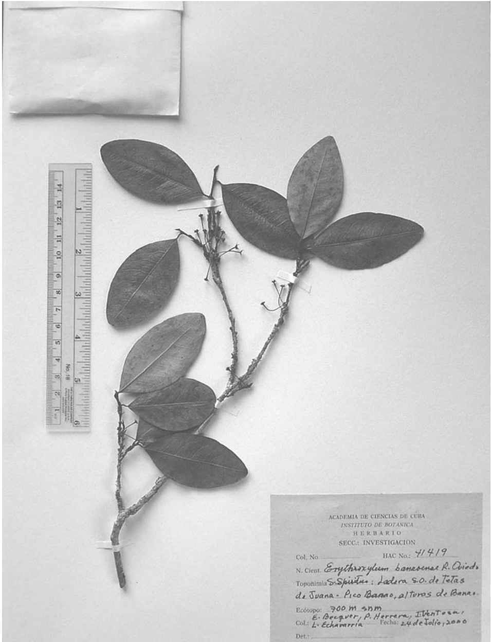
Fig. 2. Erythroxylum banaoense , holotype specimen.

Distribution and habitat. – Endemic to the Banao and Trinidad Mts of Sancti Spíritus province, central Cuba. Growing on karstic limestone bluffs, in spiny xerophilous scrub on serpentine and in lowland rainforest, at 400-900 m above sea level, tolerating some anthropic influence. Flowering May to June, fruiting June to July.