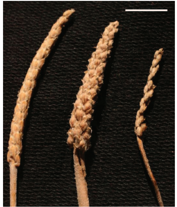
Fig. 2. Diagnostic spike shape and peduncle width in three species of Plantago in Israel: P. weldenii (left), P. crypsoides (centre), P. sabulosa (right); for details, see text. – Scale bar = 1 cm; photograph: A. Danin.

Feinbrun (1978: 223), in the Flora Palaestina area, recognises two varieties within Plantago coronopus subsp. commutata (Guss.) Pilger: var. commutata (Guss.) Bég. and var. crassipes Coss. & Daveau. Zohary (1938: 228), in his mono-