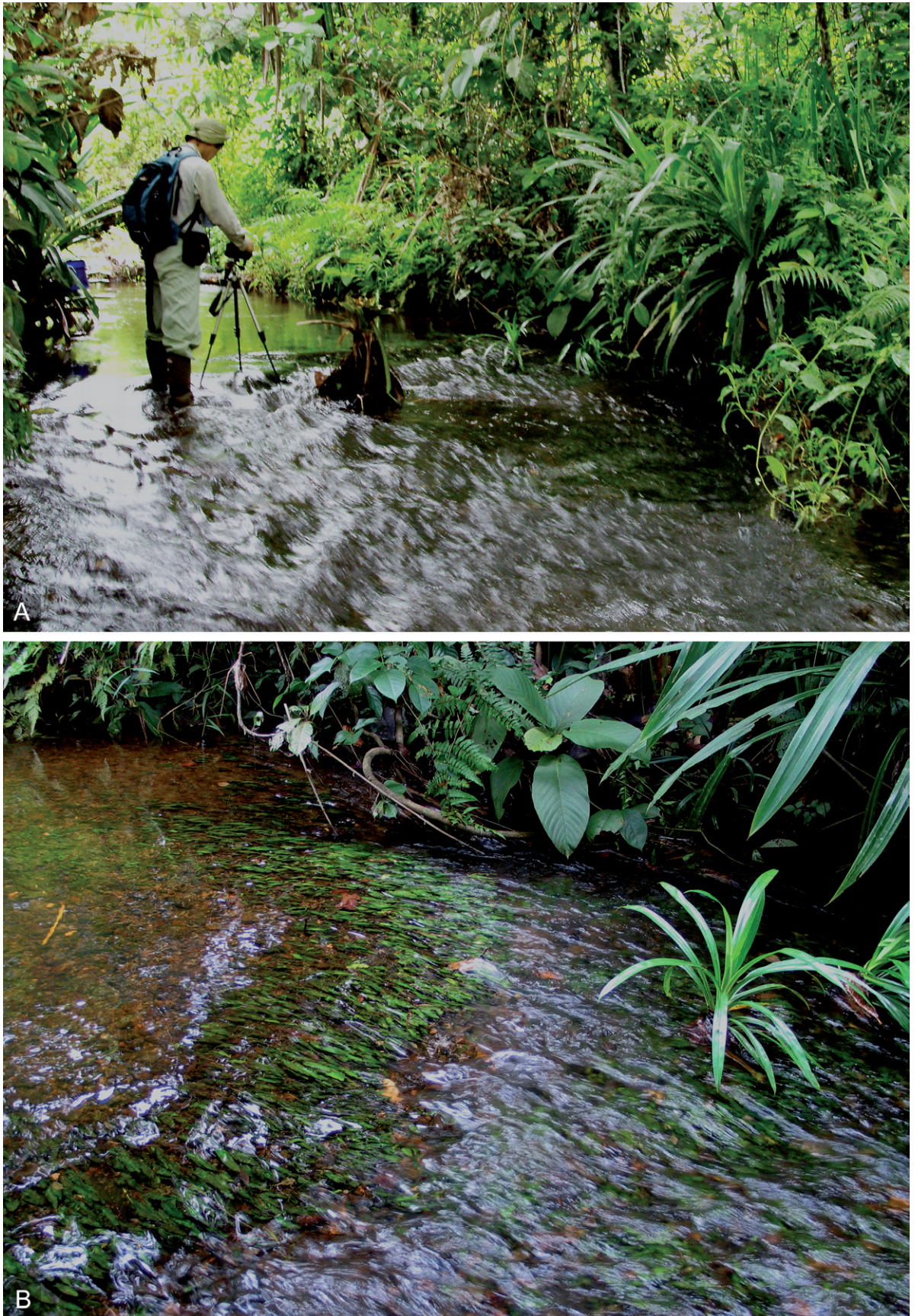
Fig. 3. Cryptocoryne versteegii var. jayaensis , habitat W of Timika – A: showing secondary tree growth along stream; B: showing photograph taken in A.