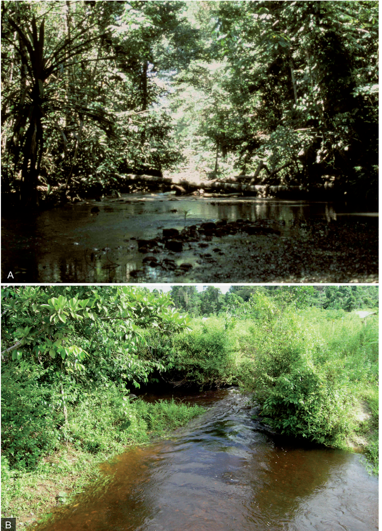
Fig. 2. Cryptocoryne versteegii var. jayaensis – A: habitat of dense stands (bottom right) in slow-flowing water at type locality in forest at Kali Kopi; B: habitat W of Timika showing forest clearing.