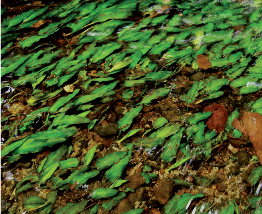
Fig. 4. Cryptocoryne versteegii var. jayaensis , habitat W of Timika, showing a closer view of plants in Fig. 3B.

Distribution — Cryptocoryne versteegii var. jayaensis was first known only from the type locality at Timika E of the Kopi River in Irian Jaya collected on 9 March 1999. However, in 1999 information also came from Mr Liem from the Aquarium firm “Vivarium” in Jakarta that they had a Cryptocoryne from Timika, and in 2003 S. Wongso saw plants in an aquarium of Mr Okky (commercial aquascaping company in Jakarta) and presented pictures of plants with narrow green leaves resembling the present var. jayaensis . On 3 May 2005 N. Takahashi and S. Wongso were not able to access the type locality but managed to collect var. jayaensis again at Timika W of the Ajkwa River, some 20 km W of the type locality: SW0502, alt. 25 m, SP V road, Timika (L, C).