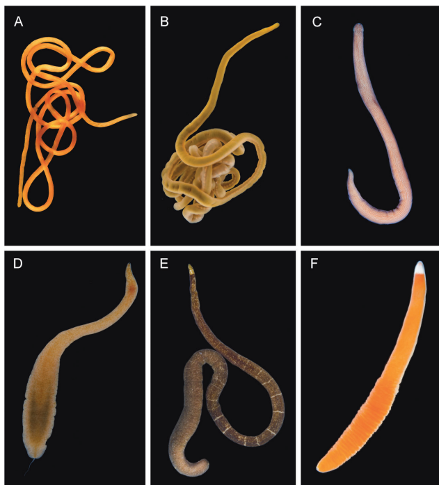
Fig. 1. Live habitus of selected specimens. (A) Cephalothrix bipunctata Bürger, 1892. (B) Cephalothrix simula (Iwata, 1952). (C) Baseodiscus delineatus (Delle Chiaje, 1825). (D) Cerebratulus fuscus (McIntosh, 1874). (E) Euborlasia elizabethae (McIntosh, 1874). (F) Leucocephalonemertes aurantiaca (Grube, 1855).

Cephalothrix cf. simula : Fernández-Álvarez and Machordom (2013), pp. 599–605, tab. 1; San Vicente do Mar, O Grove, Pontevedra, Spain; Las Represas Beach, Tapia de Casariego, Asturias, Spain; Los Chalanos Beach, Muros de Nalón, Asturias, Spain; Aramar Beach, Luanco, Asturias, Spain; Islares Beach, Castro-Urdiales, Cantabria, Spain; Colera Harbor, Colera, Girona, Spain; Faradell Islet, Cap de Creus, Girona, Spain; Alfaya et al. (2014), p. 150, tab. 2; Las Represas Beach, Tapia de Casariego, Asturias, Spain; Faradell Islet, Cap de Creus, Girona, Spain; Fernández-Álvarez and Machordom (2014), pp. 34–37, figs. and text, table on p. 37; San Vicente do Mar, O Grove, Pontevedra, Spain;