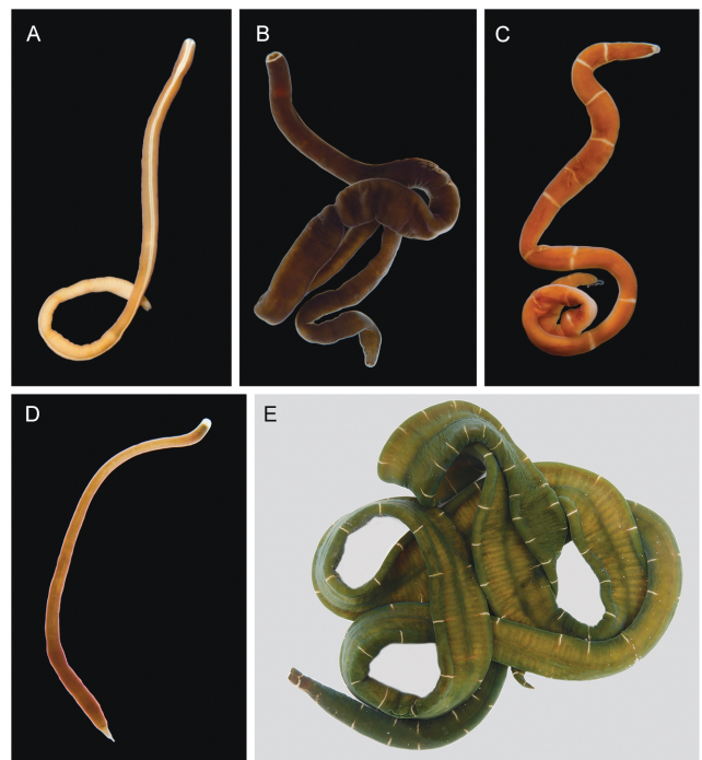
Fig. 2. Live habitus of selected specimens. (A) Lineus bilineatus (Renier, 1804). (B) Lineus grubei (Hubrecht, 1879). (C) Micrura fasciolata Ehrenberg, 1831. (D) Micrura purpurea (Dalyell, 1853). (E) Notospermus geniculatus (Delle Chiaje, 1828).

Additional new records. This species has also been recorded in Cape Vilán, Camariñas, A Coruña, Spain (AN11454).