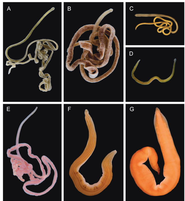
Fig. 3. Live habitus of selected specimens. (A) Emplectonema gracile (Johnston, 1837). (B) Emplectonema neesii (Ørsted, 1843). (C) Nemertopsis bivittata (Delle Chiaje, 1841). (D) Zygonemertes virescens (Verrill, 1879). (E) Tetranemertes antonina (Quatrefages, 1846). (F) Drepanophorus spectabilis (Quatrefages, 1846). (G) Paradrepanophorus crassus (Quatrefages, 1846).

Nemertes gracilis : Langerhans (1880), p. 140; Madeira, Portugal.