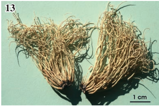
Fig.13: Usnea bogotensis .