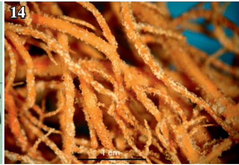
Fig. 14: Usnea rubicunda .