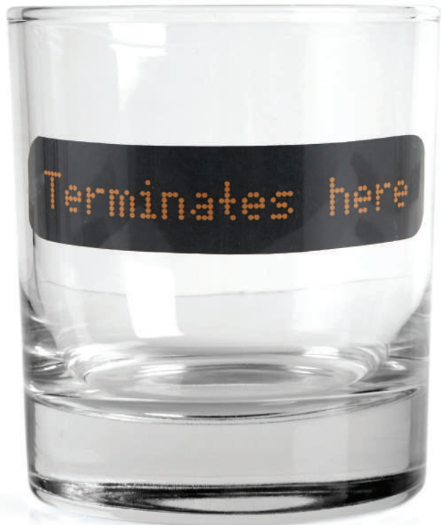
'Terminates here' glass for London Transport Museum

“The museum gift shop is quite simply the most important tool for the diffusion and understanding of art in the modern world.