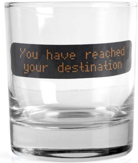
Cover: 'Private View' doorhanger for Hayward Gallery. Opposite: 'You have reached your destination' glass for London Transport Museum