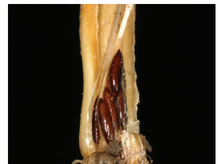
Figure 4. Puparia (flaxseeds)