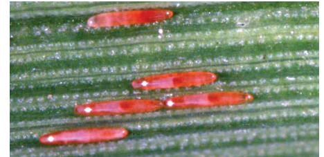
Figure 2. Eggs

Within three to 10 days, the oblong, reddish eggs hatch into tiny larvae that migrate downward during the night when humidity is high.