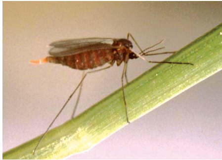
Figure 1. Adult

The Hessian fly is often ranked as the most important insect pest in winter wheat production, but this small, gnat-like fly and the injury it causes, frequently goes unnoticed until harvest.