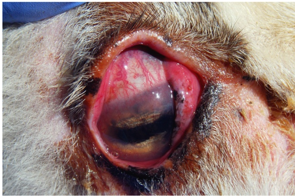
Figure 2 One of the more severe IKC cases observed during the study period, eye of a domestic sheep from the Pyrenees showing epiphora, conjunctival hyperemia, peripheral corneal edema, and neovascularization.

sampling periods (Table 1) indicate that M. conjunctivae infection is widespread among domestic sheep in the Pyrenees, endemic and self-maintained within domestic sheep flocks. This agrees with previous data on M. conjunctivae prevalence (25.8%) in domestic small ruminants from Central Pyrenees [12] and the wide distribution of M. conjunctivae infection in domestic sheep throughout Europe [4,7]. In contrast, the lower prevalence found in the Cantabrian Mountains and the fact that M. conjunctivae was detected in only one flock in this region suggest that M. conjunctivae is currently less common in this area. Moreover, the only M. conjunctivae -positive flock in the Cantabrian Mountains seasonally migrates to Caceres (South-Western Spain) in winter. Hence, the origin of M. conjunctivae in this flock is unclear and could lead to an overestimation of the endemic situation of M. conjunctivae in this region. Furthermore, the occurrence of M. conjunctivae relative to IKC cases in the two study areas strongly differed. Whereas there is a good agreement between IKC cases and the presence of M. conjunctivae in the Pyrenees, this is not the case in the Cantabrian Mountains.