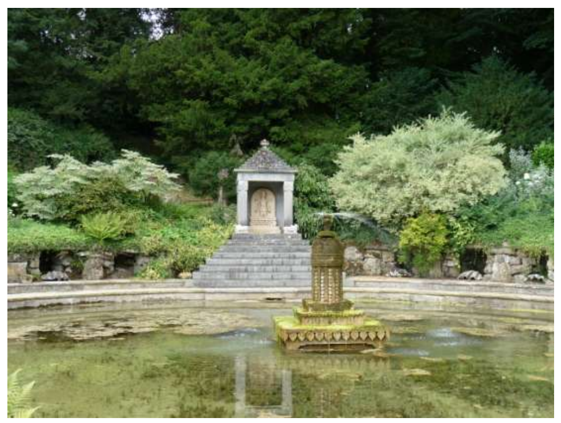
Figure 10: Shiva lingam fountain in the Temple pool, Sezincote.

It is quite possible that Charles Cockerell had a genuine interest in Indian architecture and in India culture that ran deep enough to create this Indian idyll in the heart of the English countryside. He had after all spent his most formative years in India. The octagonal room to the north of the house (see figure 6), thought to be his bedroom, faces the rising sun, which is reflected gloriously through the stained glass panels - was this a deliberate positioning or simply a response to the topographical demands of the location of the house in the Cotswold hills? The design of the Temple pool with its temple to the sun god Surva, its fountain and indeed the shape of the pool itself, also warrant consideration with its references to Indian religious and spiritual beliefs. The fountain in the middle of the yoni shaped pool rises like a Shiva lingam , fed from a natural spring, and water cascades down through the Thornery in a regenerative sense (see figure 10). The Indian bridge, clearly inspired by the Caves of Elephanta in Mumbai Harbour, is built with Hindu columns, four deep, with stepping stones underneath and a stone seat in the middle, offering a place of quiet contemplation. Head suggests these columns were used for more functional reasons, offering the practical strength to carry the weight of a horse and carriage (see figure 11). 63 Mughal columns being more delicate might not have stood the test of time quite so well; the bridge is still in use today and is