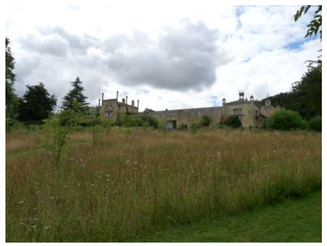
Figure 7: The farm buildings, Sezincote.

The overall aesthetic effect of the exterior of Sezincote finds reference in the Picturesque, with its sense of strangeness and artifice amid the dramatic, romantic landscape of its setting. Whilst from the outside Sezincote resembles the mausoleums depicted in Thomas Daniells' Indian paintings and engravings, once inside the aesthetic changes, remaining faithful to the more traditional neoclassical style. The complexity of the Indian stylisation with its mix of Hindu and Muslim architectural styles is blended with the symmetry and order of European neo-classicism, allowing for the conflation of East and West: an elaborate Eastern exterior belies an interior that operated as a functional domestic space.