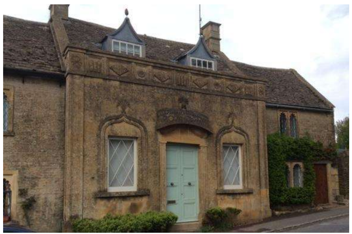
Figure 14: Spa Cottage, Lower Swell, Gloucestershire.

In terms of a legacy to British architecture and the impact of empire on domestic Britain, Brighton Pavilion is the only notable building influenced by Sezincote, beyond this, no national style really endured. In 1806 Humphry Repton had recorded his appreciation of the Indian style he saw developing at Sezincote: