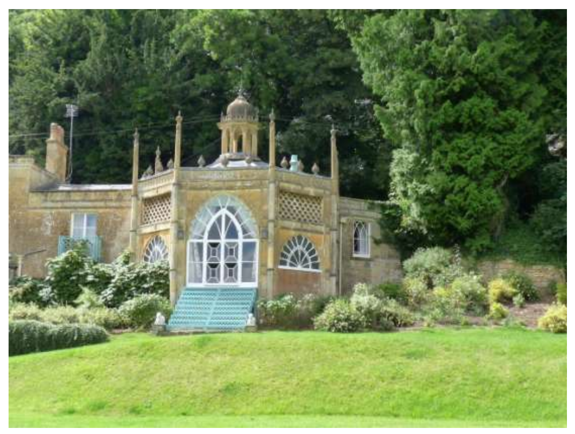
Figure 6: The octagonal or 'tent' room, Sezincote.

The gardens are resplendent with architectural and topographical references to Indian landscape and Indian religious culture: the Thornery - the water garden to the north of the house with the Indian bridge with its Brahmin bulls and lotus buds, its Temple pool with the shrine to the Hindu god, Surya, and a serpent fountain - provides a dramatic focal point (see figures 10, 11, 12 and 13). Grottoes hollowed out of the sloping banks, and curving rockeries with dramatically large boulders reminiscent of untamed Indian landscapes, surround the Temple pool and the descending pools. To the south of the house is a limestone grotto containing an Indian white marble water maze. The farm buildings and dairy are not exempt from the Indian influence, forming a complex reminiscent of an Indian fort (see figure 7). Two of the lodges at one of the entrances to Sezincote were originally modelled along the lines of a Bengal hut.