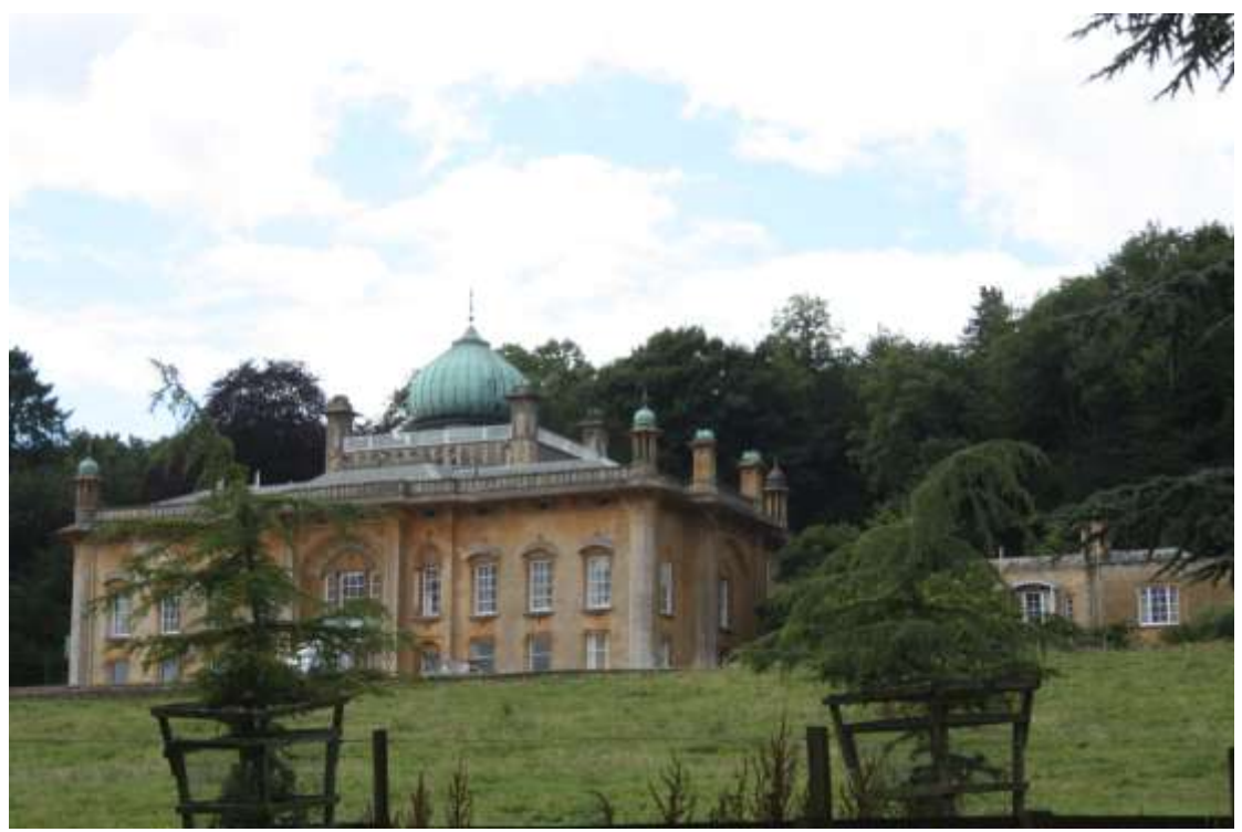
Figure 2: East façade, Sezincote; the copper Mughal-style dome dominates the skyline.

By the standards of early nineteenth-century country houses, Sezincote was relatively small. Its underlying structure follows the conventions of Georgian villa design, with a central block flanked by wings ending in pavilions, while the