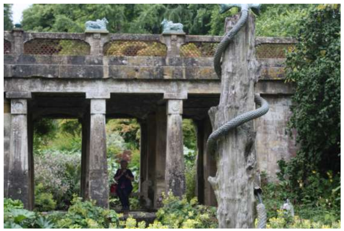
Figure 11: Detail of the Indian bridge, Sezincote, showing the stone seat, the serpent fountain and Brahmin bulls.

now required to bear the weight of cars. At Sezincote, Indian architecture has been adapted successfully to accommodate the practical demands of an English country estate.