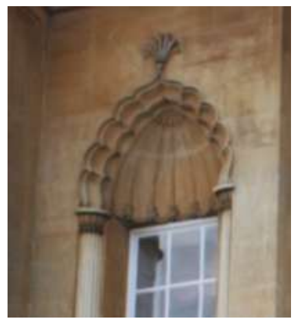
Figure 3: Detail of east façade, Sezincote, showing the chajja (deep overhanging eaves), one of four chattris (minarets) marking the corners of the central block and two-storeyed gateway style entrance.