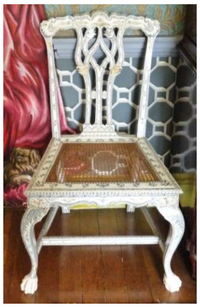
Figure 18: Chair, sandalwood with ivory veneer, black lac and gilt, cane seats, maker unknown, Vizagapatam, c.1770, Sezincote.

Lamps made from metal Chinese tea caddies light up the entrance hall where six of the seven paintings (commissioned by Sir Charles from Thomas Daniell) of the remodelled Sezincote once again hang, having been traced and bought by the Kleinwort family. Their presence is a testament not only to Daniell's work as an artist and at Sezincote, but it is also a testament to the longevity of Sezincote: they are a rare reunion of subject and painting. The set of ornamental spears said to have been used by Charles Cockerell as tent poles in his former bedroom, are now used as bedposts in one of the main bedrooms; rich and elegant fabrics now drape over them in much the same way that Sir Charles draped Indian architectural features over his Georgian country house. His former bedroom, the tent room, has been reimagined as it might have been and now houses a canopy depicting the stars on its underside whilst the walls are draped, tent style, in printed cotton specially commissioned from India. The current owners (the third generation of the Kleinwort family at Sezincote), travelled to India to commission and oversee the production of the fabrics. <sup>98</sup> In the dining room a