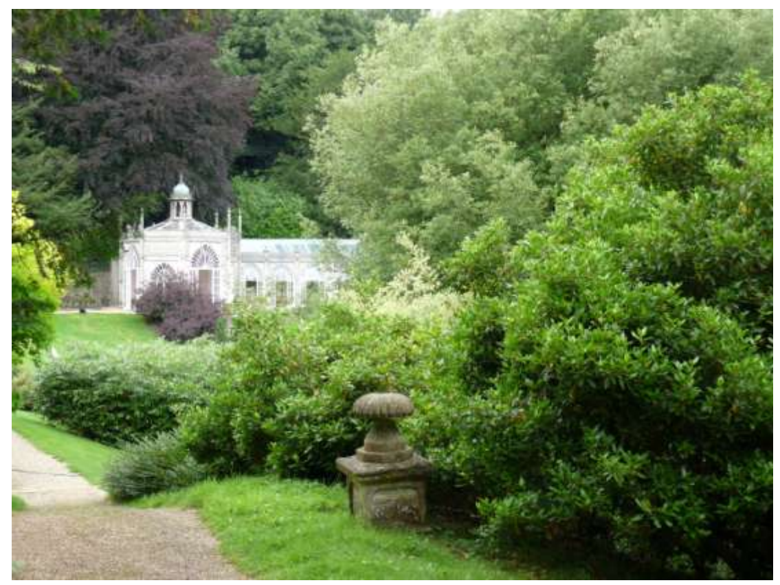
Figure 5: The pavilion at the end of the orangery, Sezincote.

To the south of the house is the sweeping, curved orangery, with more peacock tail arches. The octagonal pavilion at the end of the orangery, with its 'riot of colonettes, finials, delicate panelling, cupolas and coloured glass' was once home to an aviary for exotic birds (see figure 5).<sup>10</sup> It is now the venue for afternoon tea served to the visiting public. To the north of the house is the octagonal or 'tent' room believed to have been Sir Charles Cockerell's bedroom. It is thought to have been decorated to resemble a tent, with wooden, decorative spears supporting a canopy (see figure 6).<sup>11</sup> A curved passageway with iron trellis once connected this room to the house.