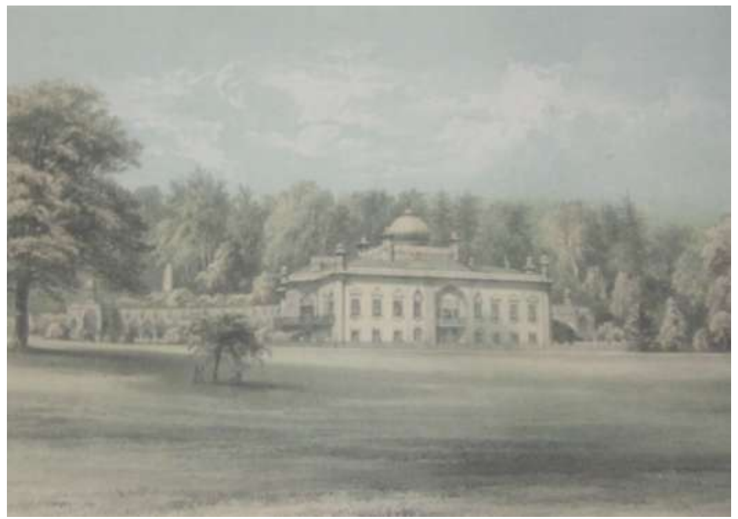
Figure 1: Sezincote, Moreton in Marsh as depicted in the 1884 sale particulars.

Please note that this case study was first published on blogs.ucl.ac.uk/eicah in May 2014. For citation advice, visit: <a href="http://blogs.uc.ac.uk/eicah/usingthewebsite">http://blogs.uc.ac.uk/eicah/usingthewebsite</a>.