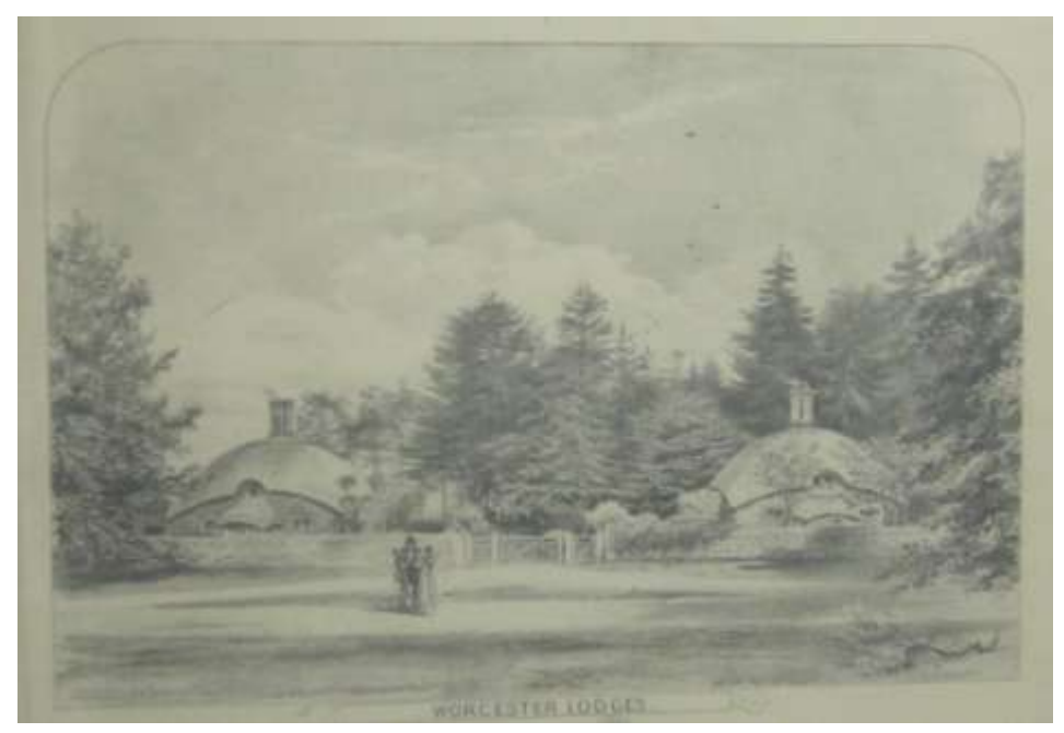
Figure 16: Worcester Lodges, Sezincote, as depicted on the 1884 sale particulars in the private collection at Sezincote.

If the house at Sezincote did not create a national style as a legacy, then the Worcester Lodges at one of the entrances to Sezincote may have taken up this mantle. Designed by Charles Robert Cockerell at the behest of his uncle, the lodges with their curvilinear roofs resembled the Bengal huts often depicted in Oriental Scenery (see figure 16).<sup>81</sup> Head suggests they were the first buildings in Britain to represent Indian vernacular architecture, and that they were the forerunners of the bungalow.<sup>82</sup> The lodges have since been remodelled. This subject requires more research beyond the reach of this case study but is interesting from the perspective of the impact and legacy of empire on domestic Britain.