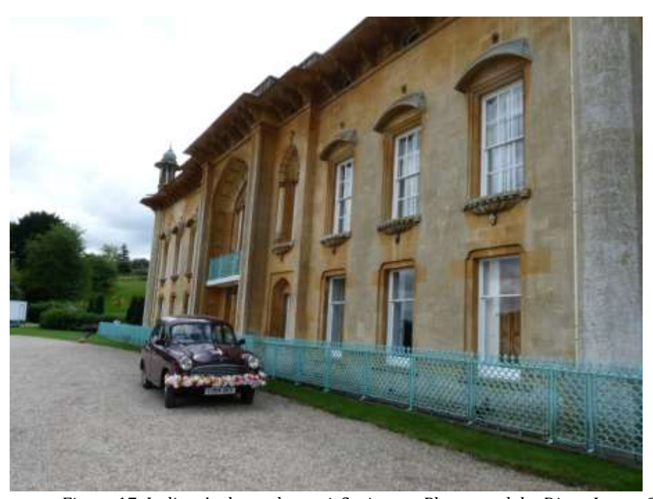
Figure 17: Indian Ambassador taxi, Sezincote.