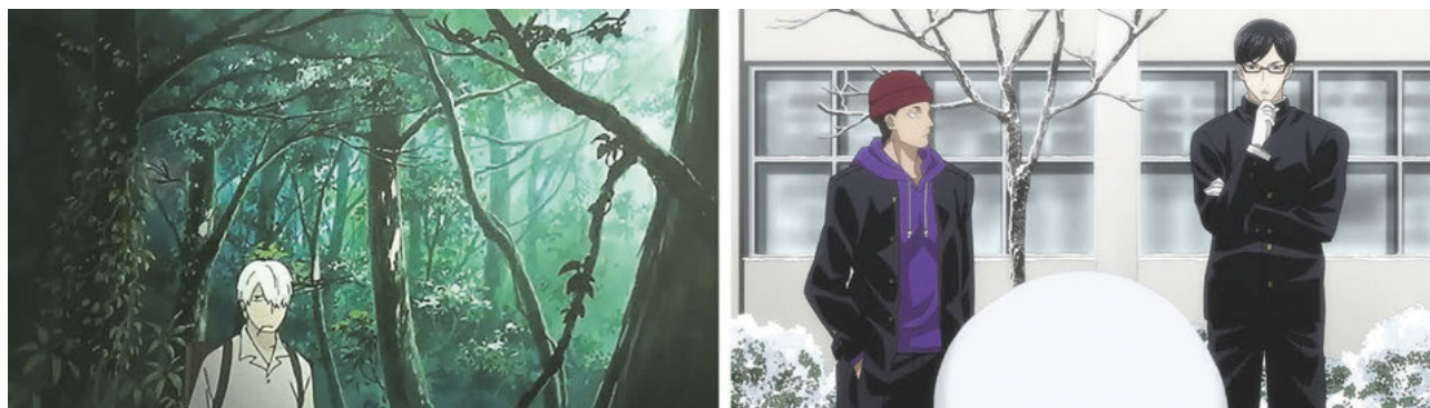
Figure 1. Screenshots of Mushi-shi (2005) and Haven't you heard? I'm Sakamoto (2016), from left to right.

Poitras (2001) dedicates a chapter to anime genres, discussing several genres and subgenres. The genre/subgenre ordering of the chapter suggests a hierarchical organiza-