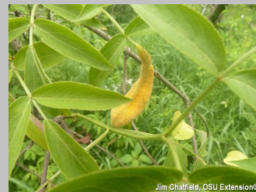
Elderberry rust on wild elderberry.

Elderberries are generally hardy plants, but they are susceptible to diseases. Some common diseases that may affect elderberries include powdery mildew, canker diseases such as Botryosphaeria , Nectria and Diaporthe , anthracnose (fruit and leaves), Alternaria leaf spot and fruit rot, tomato ring spot virus, cherry leaf roll virus, and bacterial leaf spot. However, the most common disease in our region is rust. To manage and prevent diseases, it's important to practice good sanitation practices, provide proper spacing between plants for adequate air circulation, avoid overhead irrigation, and remove wild elderberry and sedges (for rust prevention) from around the planting. Additionally, applying fungicides for the fungal diseases as preventive measures may be helpful.