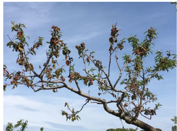
Figure 1. Peach leaf curl is most effectively controlled using Ferbam or Ziram.

The EPA docket number and a summary of the risks of concern and proposed mitigation for each fungicide is provided in this article.