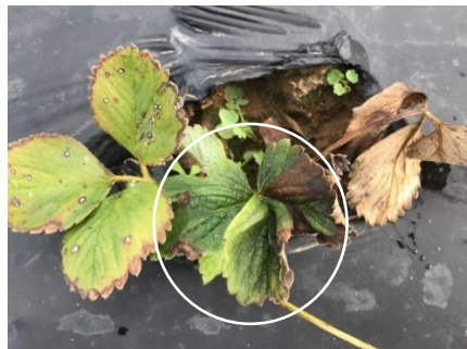
Figure 2. Leaf symptoms of Neopestalotiopsis disease on strawberry.

Before planting, growers should segregate plants with typical leaf lesions that resemble Neopestalotiopsis disease (Figure 2) and send samples to the OSU Plant and Pest Diagnostic Clinic in Wooster, OH for confirmation. Plants confirmed to have Neopestalotiopsis disease should not be planted. Other diseases of strawberry that were diagnosed include anthracnose crown rot, Phytophthora crown and root rot, and leaf scorch.