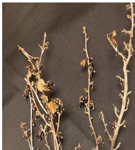
Figure 4. Symptoms of currant cane blight. Notice the yellow wilted leaves on the canes.