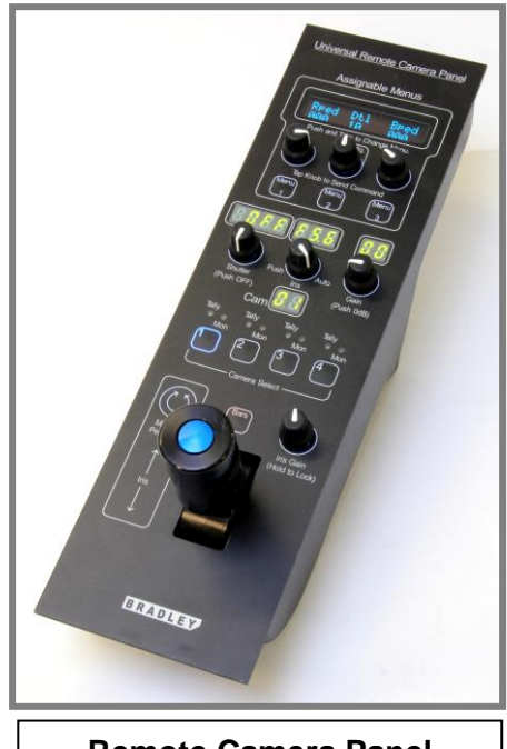
Remote Camera Panel

Please refer to our website for details of other products that we offer http://br-remote.com/products