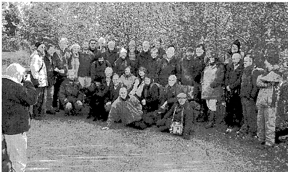
Fig. 1 The group at Fyfield Down