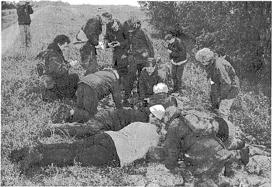
Fig. 1 Participants examining the former sea dyke at Nijkerk .