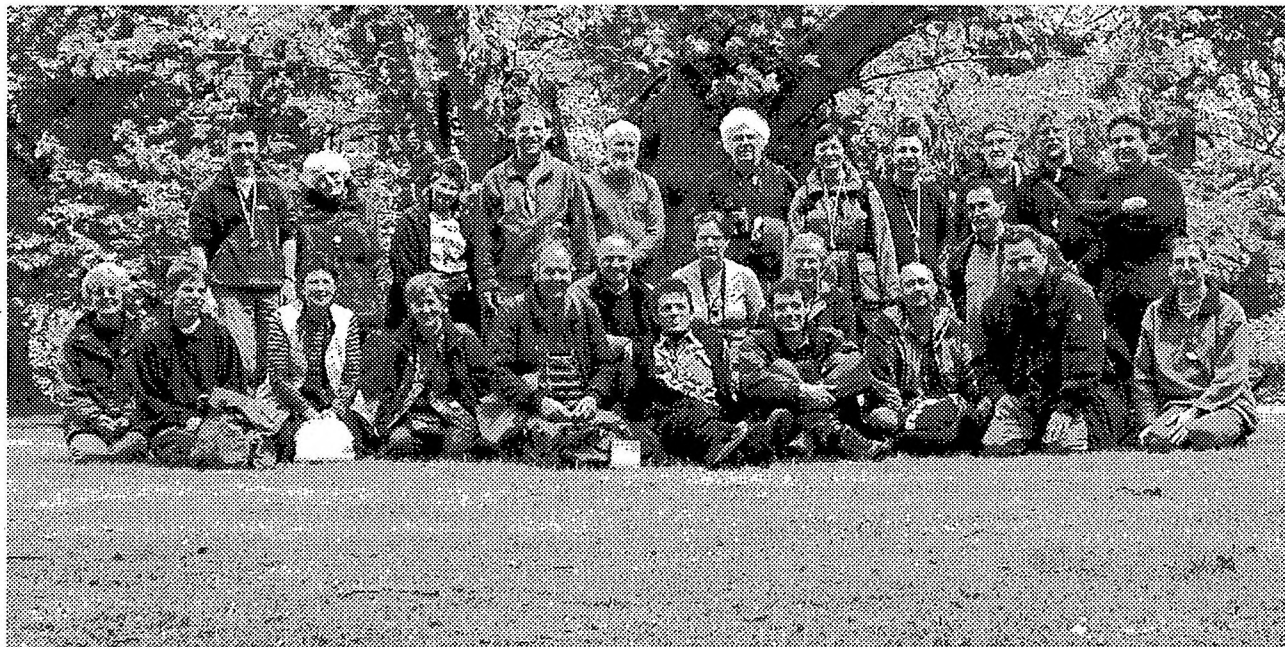
Fig 2 The party in the Royal Park at Het Loo