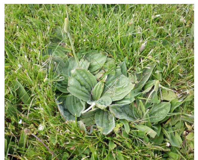
Plantago media

The records for this Register have been selected from the databases held by the Botanical Society of Britain and Ireland (BSBI).