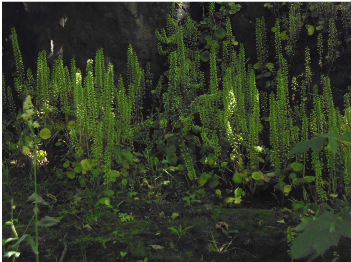
Umbilicus rupestris on shady rocks beside the stepped path leading to the summit of Calton Hill, Edinburgh. This was a new site for this species on 7<sup>th</sup> September, 2011, when discovered by B.E.H.S. This photograph was taken on 18<sup>th</sup> June, 2014, when the colony had grown a bit.