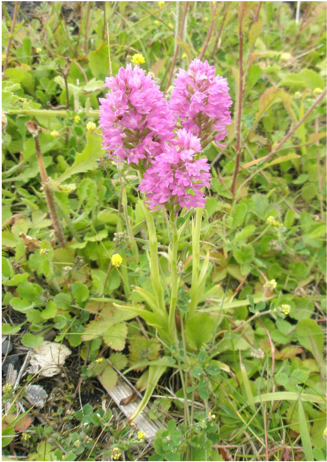
Anacamptis pyramidalis, extinct in VC 83