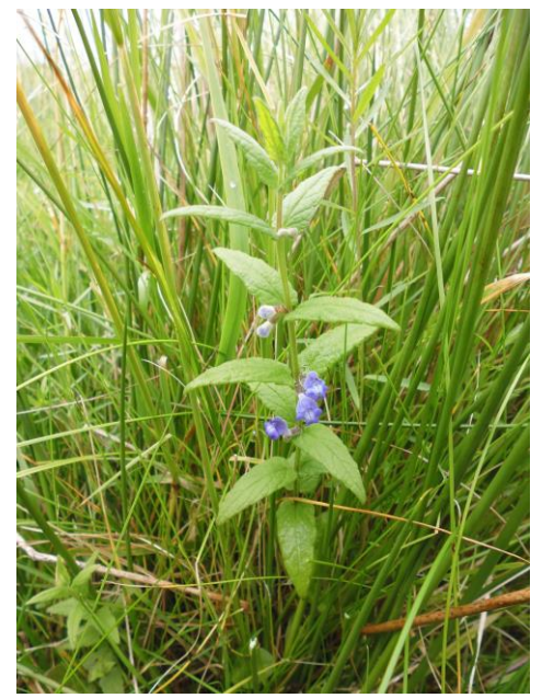
Scutellaria galericulata