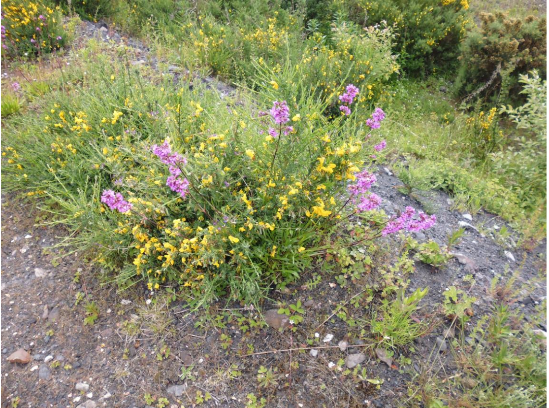
Silene viscaria among natural vegetation on the edge of the disused Monktonhall Bing. Photographed on 25<sup>th</sup> May, 2019

Botanical Society of Britain and Ireland: bsbi.org Botanical Society of Scotland: <u>www.botanical-society-scotland.org.uk</u> British Pteridological Society: ebps.org.uk Historic Environment Scotland (formerly Historic Scotland): www.historicenvironment.scot Joint Nature Conservation Committee: jncc.gov.uk National Biodiversity Network: nbn.org.uk National Trust for Scotland: www.nts.org.uk NatureScot (formerly Scottish Natural Heritage): www.nature.scot Online Atlas of the British and Irish Flora: www.brc.ac.uk/plantatlas Pentland Hills Regional Park: www.pentlandhills.org Plantlife Scotland: www.plantlife.org.uk/scotland Royal Botanic Garden Edinburgh: www.rbge.org.uk Scottish Wildlife Trust: scottishwildlifetrust.org.uk The Wildlife Information Centre (TWIC): www.wildlifeinformation.co.uk UK Grid Reference Finder: gridreferencefinder.com Woodland Trust: www.woodlandtrust.org.uk