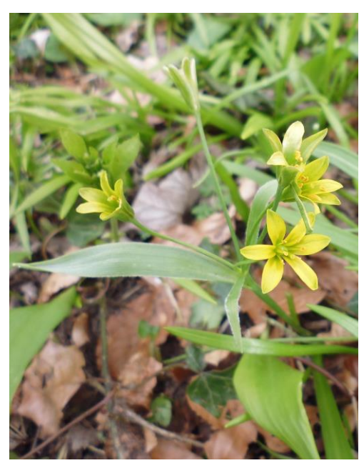
Gagea lutea