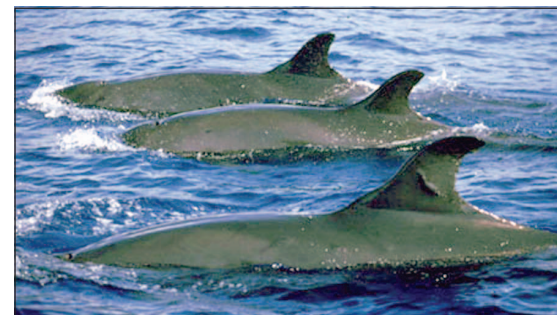
A small population of about 123 false killer whales resides near the Hawaiian Isles.