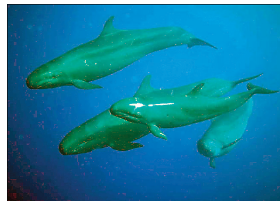
A group of false killer whales from the insular population.