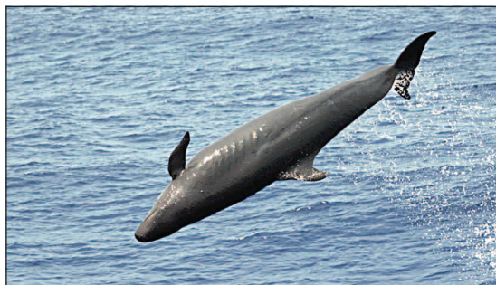
A false killer whale from the offshore population leaping while chasing prey.