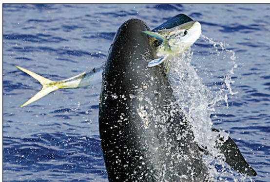
A false killer whale grinds a fresh mahimahi.

PHOTOS TAKEN UNDER NMFS SCIENTIFIC RESEARCH PERMIT NO. 731-1774