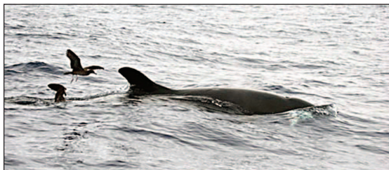
False killer whale carrying prey, followed by wedge-tailed shearwaters.