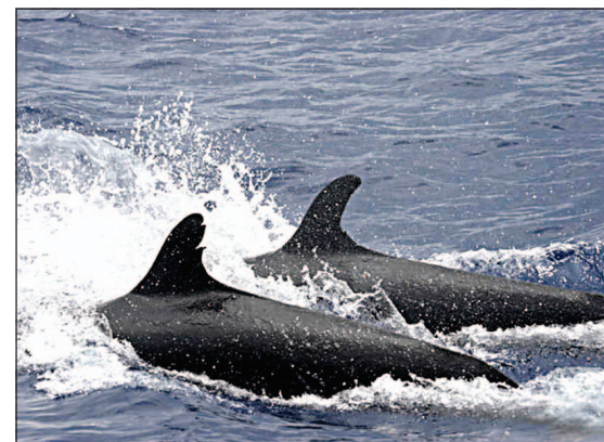
Offshore false killer whales on Jaggar Seamount.