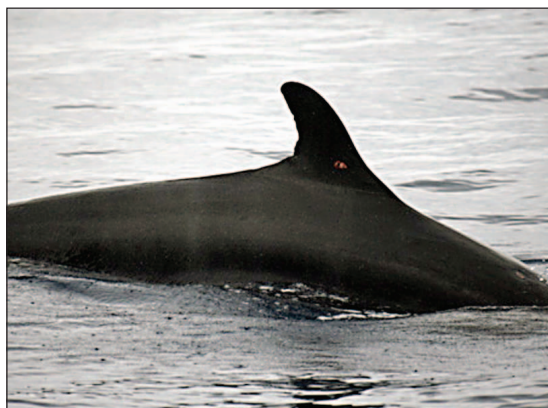
False killer whale with a satellite tag in its dorsal fin.

P.S. If you are interested you can download a report showing some of these movements at < http://www.cascadiaresearch.org/robin/falsekillerwhale.htm >.