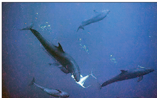
False killer whales with yellowfin tuna.

Like the killer whale (not particularly closely related but with a similar skull), false killers are long-lived (into their 60s), slow to reproduce (having one calf only every six or seven years), and do not start reproducing until their teens. Thus, false killer whale populations would be very slow to recover from any anthropogenic impacts. Also like killer whales, false killers are upper-trophic level predators, thus are likely to accumulate high levels of toxins and be impacted by competition with human fisheries.