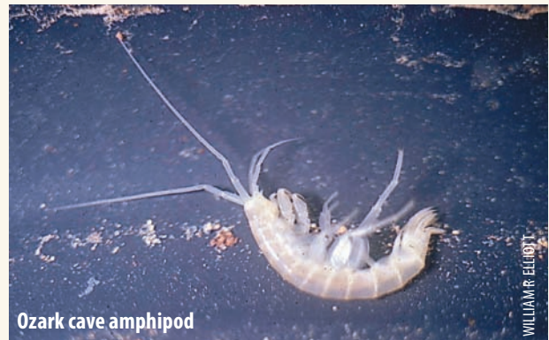
Ozark cave amphipod