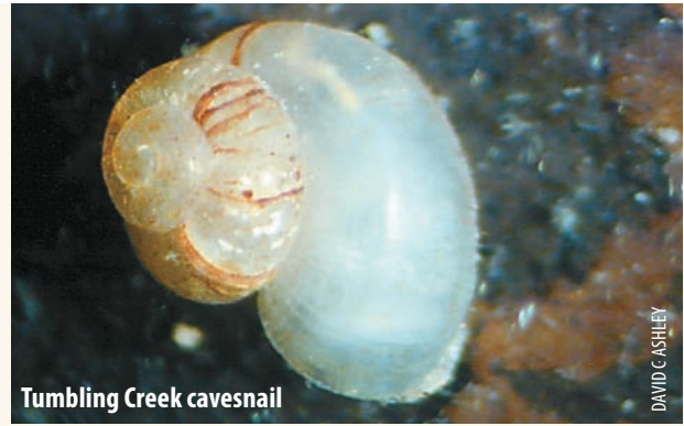
Tumbling Creek cavesnail