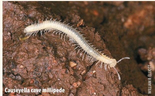
Causeyella cave millipede